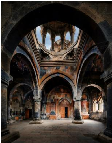
07_HOVHANNAVANK MONASTERY / Aragatsotn Province, 4th–13th century