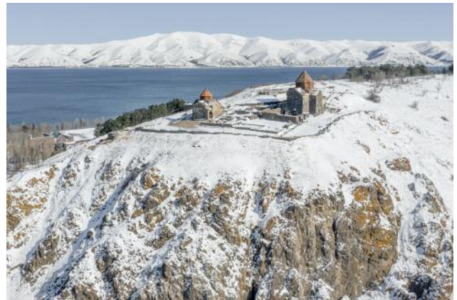
08_SEVANAVANK MONASTERY / Gegharkunik Province, 9th century