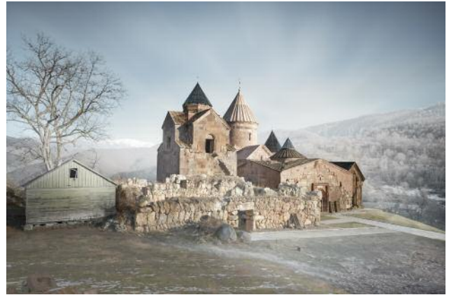
02_GOSHAVANK MONASTERY / Tavush Province, 12th –13th century