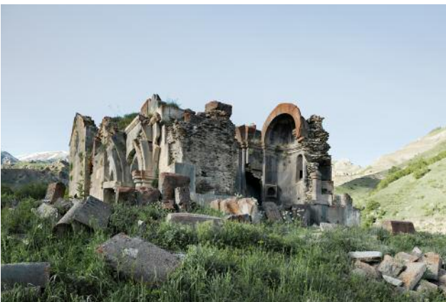
09_ARATES MONASTERY / Vayots Dzor Province, 9th–13th century