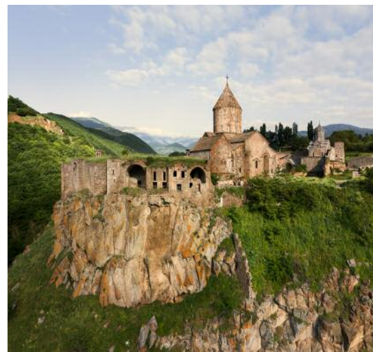
10_TATEV MONASTERY / Syunik Province, 9th–17th century