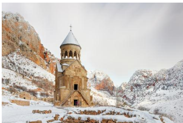
11_NORAVANK MONASTERY / Vayots Dzor Province, 12th–14th century