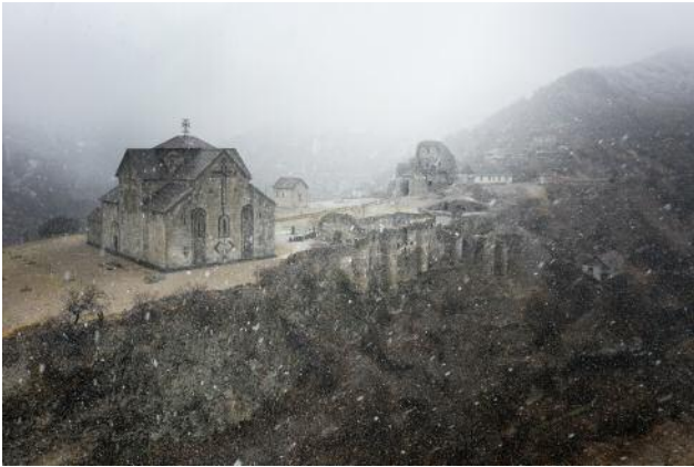
01_AKHTALA MONASTERY / Lori Province, 10th –13th century