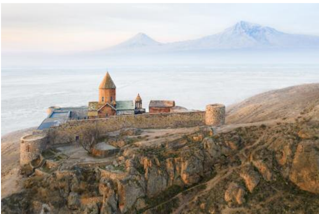
03_KHOR VIRAP MONASTERY / Ararat Province, 7th –17th century