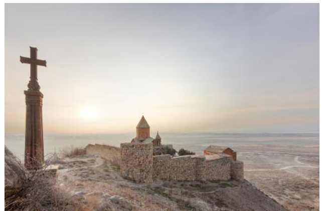
04_KHOR VIRAP MONASTERY / Ararat Province, 7th –17th century