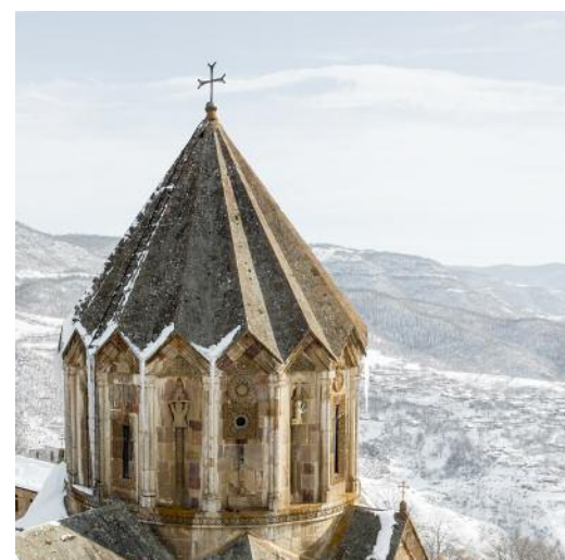
12_GANDZASAR MONASTERY / Artsakh, 13th century