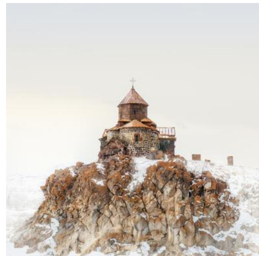
06_HAYRAVANK MONASTERY / Gegharkunik Province, 9th– 12th century © Ted & Nune