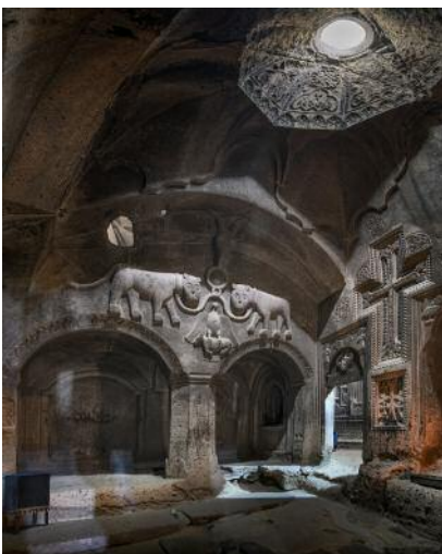
05_GEGHARD MONASTERY / Kotayk Province, 4th –13th century