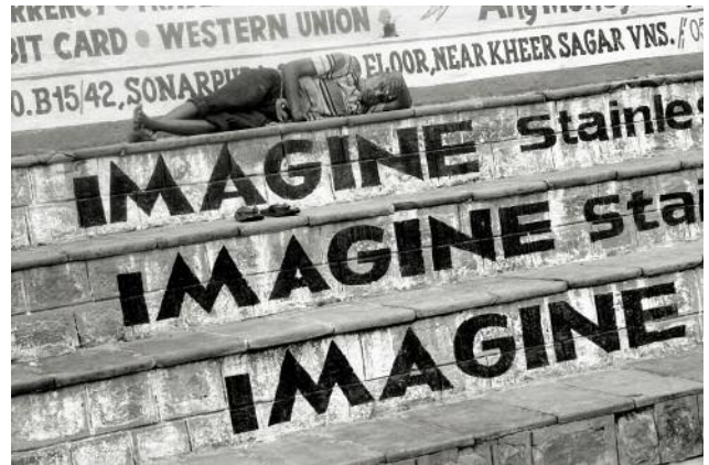
02 Varanasi, 2010