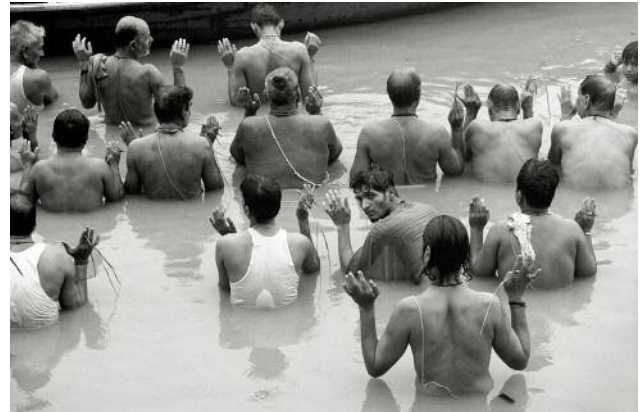
06 Varanasi, 2010