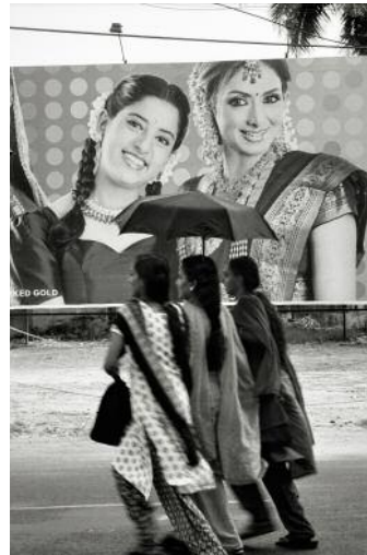
12 Alappuzha, 2009