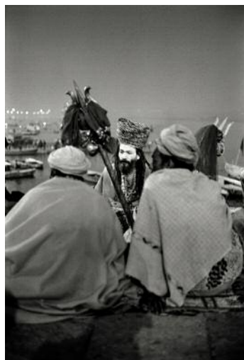
11 Varanasi, 2017