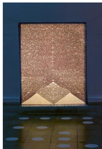
06 MaSo carpet