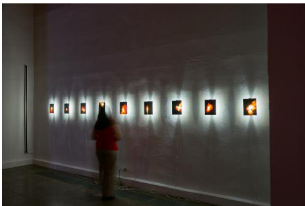
05 Neuf portes de ton corps Artworks © Tim Otto Roth.