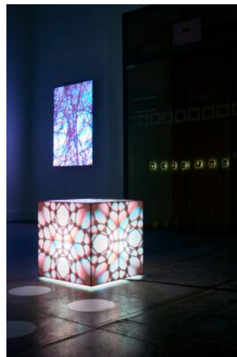
04 Light sculpture and Toile d'araignée . Artworks © Tim Otto Roth.