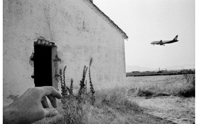
10 © Tomeu Coll