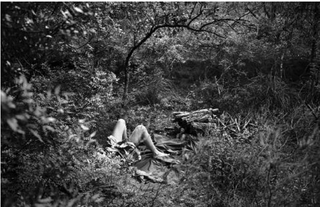
09 © Tomeu Coll