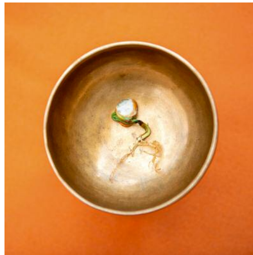
10_Untitled 6293, 2021