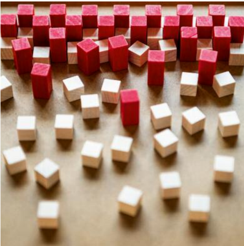
03_Untitled 4964, 2021