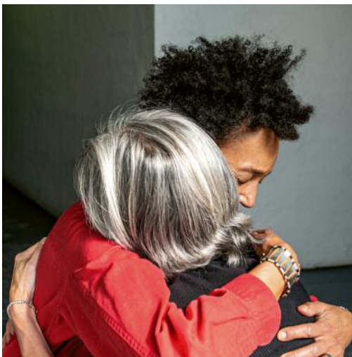
11_Untitled 7336, 2020 © Torrance York