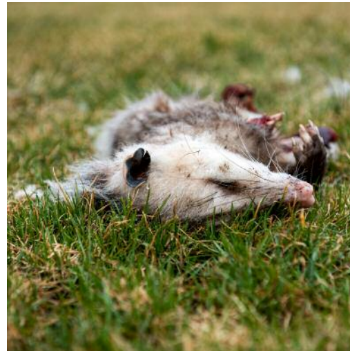
12_Untitled 6201, 2020 © Torrance York