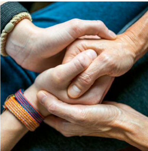
09_Untitled 8019, 2020 © Torrance York