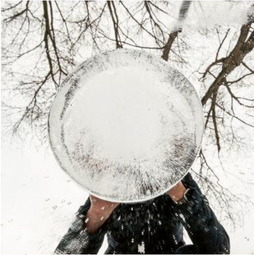
07_Untitled 5365, 2021 © Torrance York