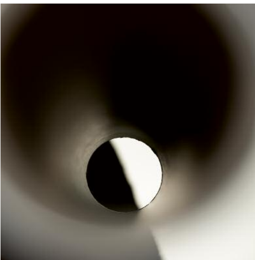
05_Untitled 9390, 2020