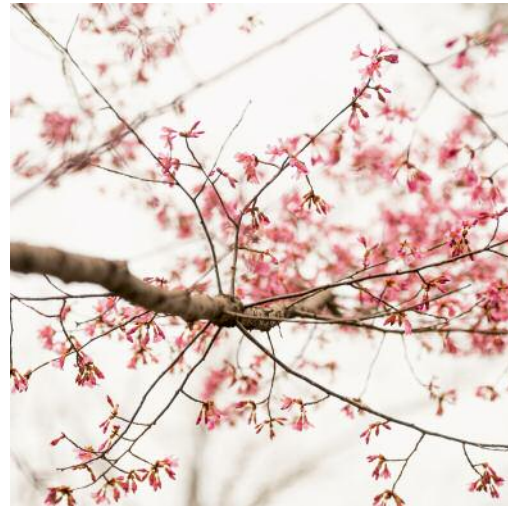
04_Untitled 51567, 2013