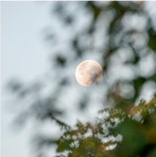
01_Untitled 1618, 2020