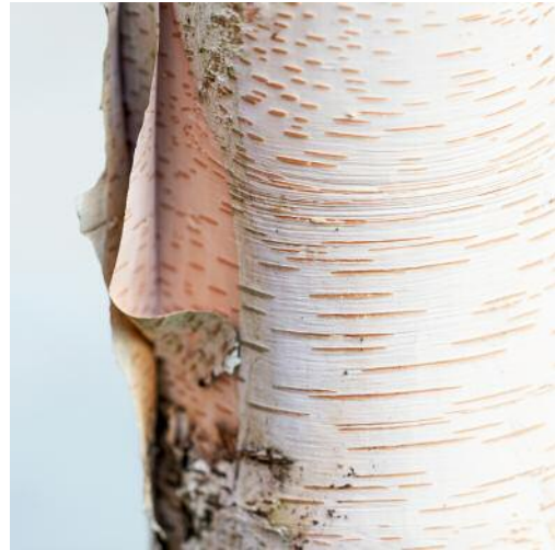
08_Untitled 4174, 2019