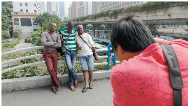
3_ DANIEL TRAUB, Zeng Xian Fang photographing three men, November 23, 2011 (video still)