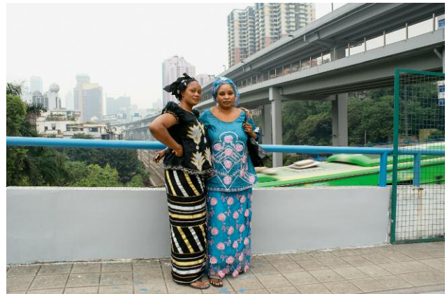
12_WU YONG FU, TWO WOMEN, APRIL 22, 2009