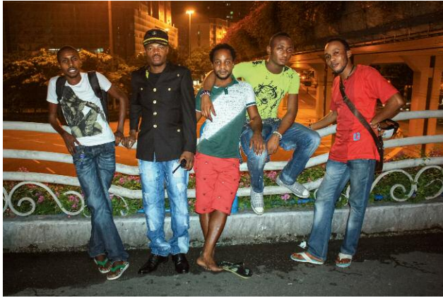
7_ZENG XIAN FANG, FIVE MEN, AUGUST 11, 2012 © ZENG XIAN FANG