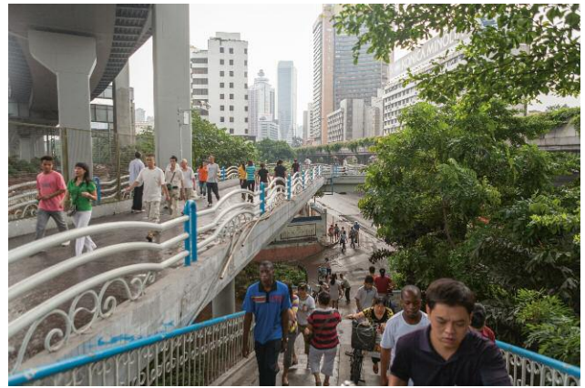
2_ DANIEL TRAUB, The pedestrian bridge, July 30, 2009 © DANIEL TRAUB