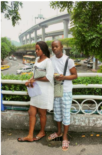
9_ZENG XIAN FANG, COUPLE IN WHITE, AUGUST 23, 2013