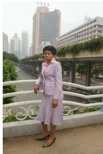
10_WU YONG FU, WOMAN IN LAVENDER, OCTOBER 10, 2010 © WU YONG FU