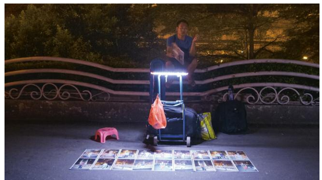
6_ DANIEL TRAUB, Zeng Xian Fang waiting for customers, August 10, 2013 (video still)