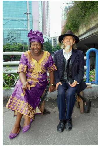
8_ZENG XIAN FANG, WOMAN AND MAN, NOVEMBER 11, 2012 © ZENG XIAN FANG