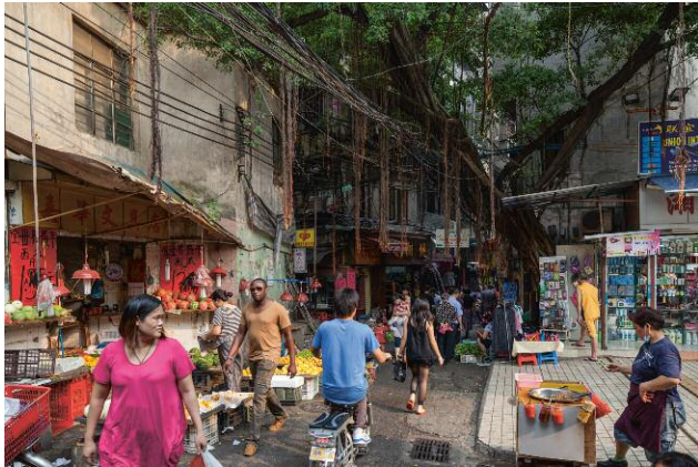
1_ DANIEL TRAUB, Baohan Straight Street, Dengfeng village, May 4, 2012