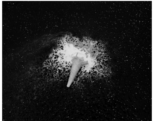
2. The Milky Way, October 2010