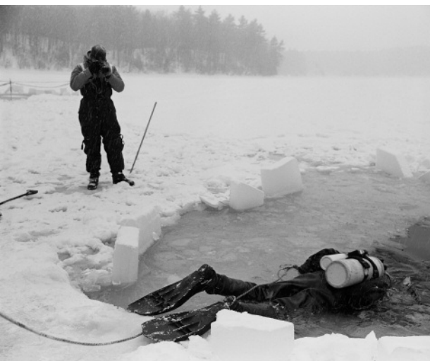
5. Massachusetts State Trooper under water recovery training, February 2014