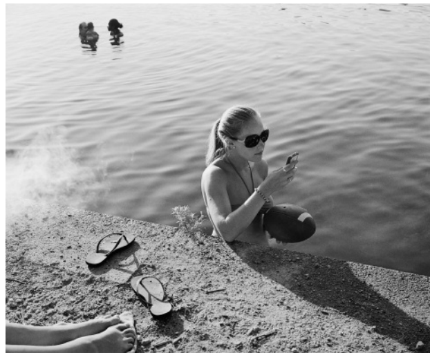
10. Phone, Football, Smoke, July 2010