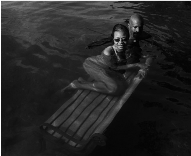
7. Submerged park bench, high-water, bathers, August 2010