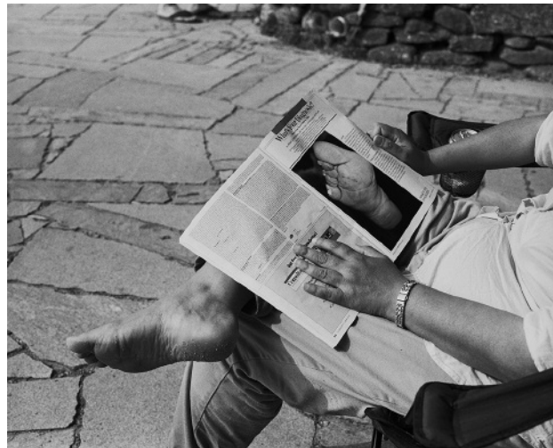
12. Whats your diagnosis?, August 2010