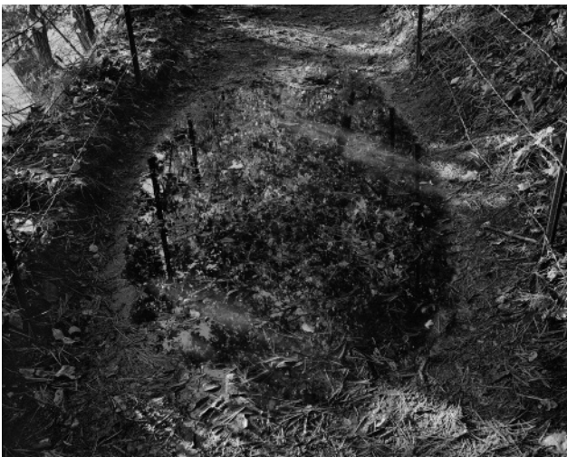
11. Puddle, November 2011