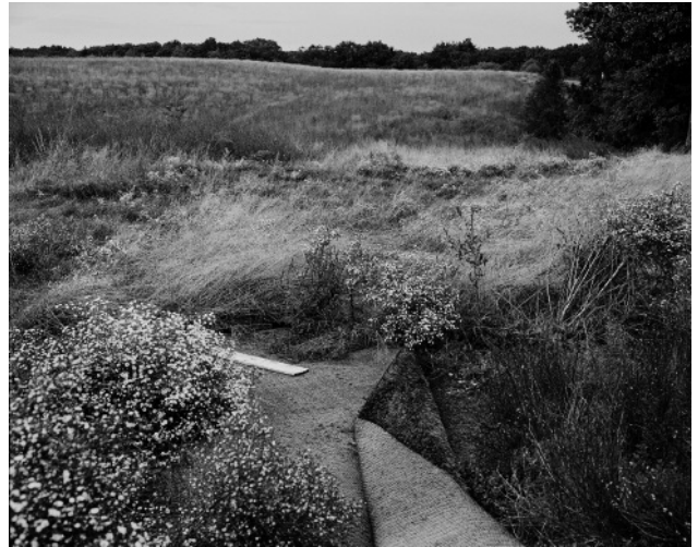
14. Astro turf, Concord landfill, October 2011