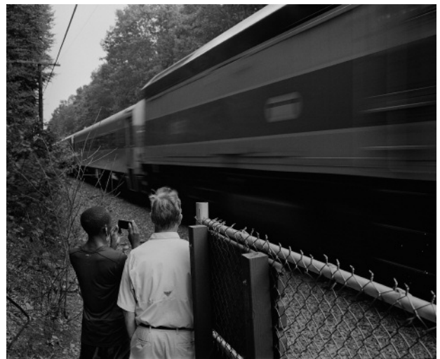
6. The Fitchburg railroad, 40 ft. from ponds edge, onlookers, August 2012