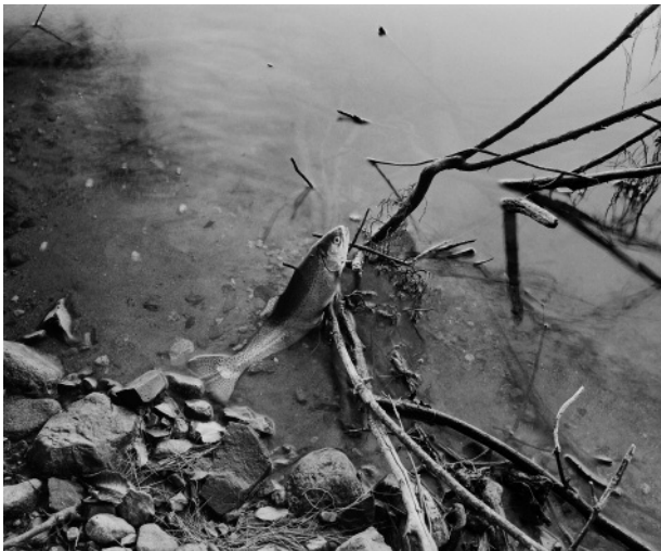
3. Trout, pond stocked by the state, July 2011