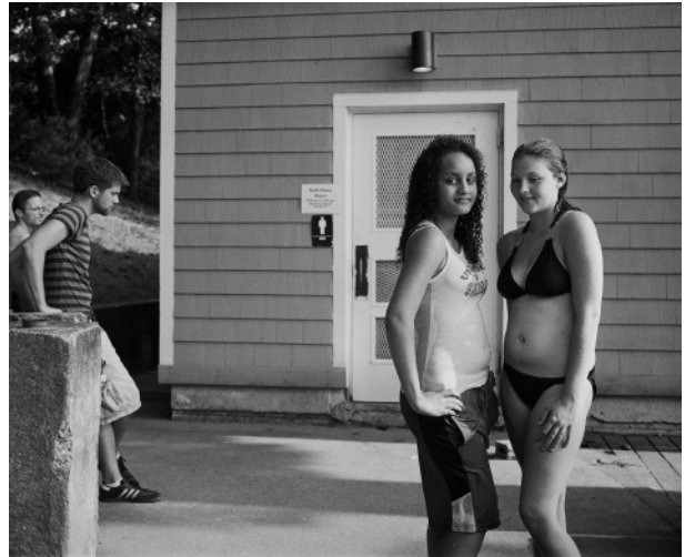
8. Girls posing by the bath house, July 2010