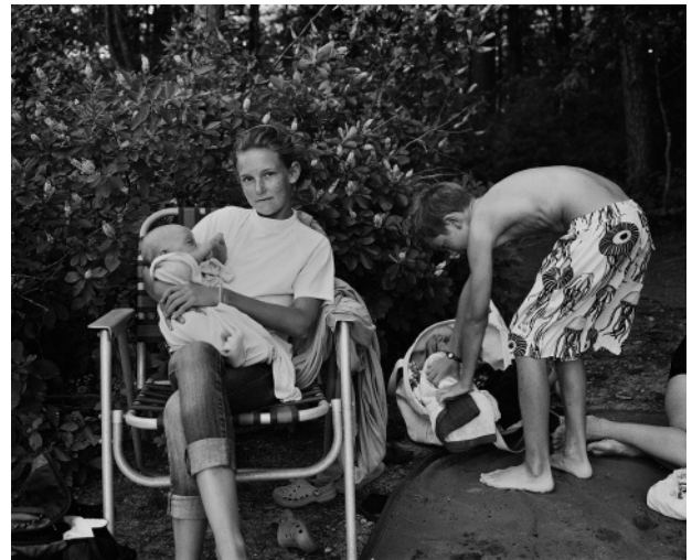
4. Mothering, August 2011