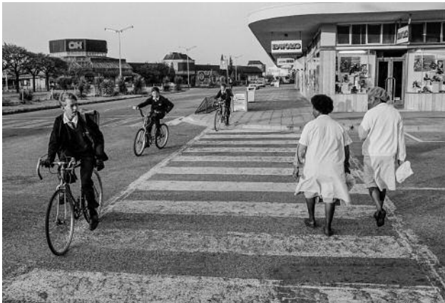
3 Ad van Denderen, Mooi West, Welkom, 1990