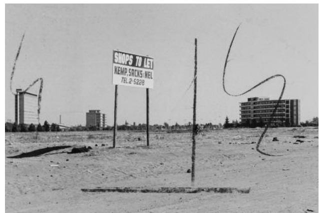
12 Vista krantenarchief, Welkom, 1950's