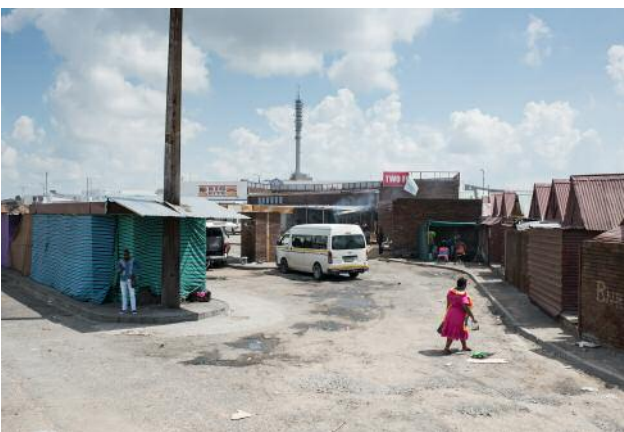
5 Ad van Denderen, Welkom centrum, 2017