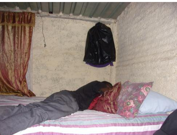
11 Thabo Mōdikeng, workshop participant Teto High, 2017