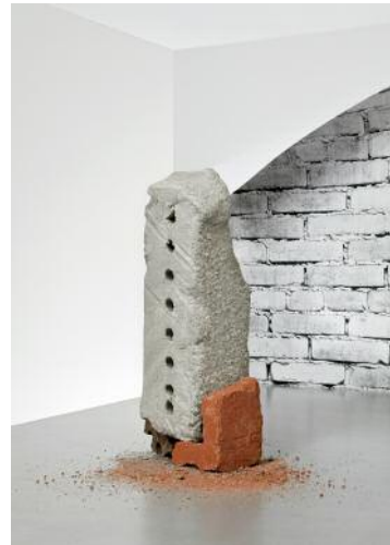
08 Anu Vathra, Untitled Monolith III , 2018 © Anu Vathra