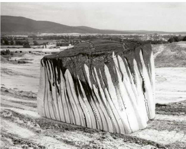
03 Taiyo Onorato & Nico Krebs: Brick 5 , 2017