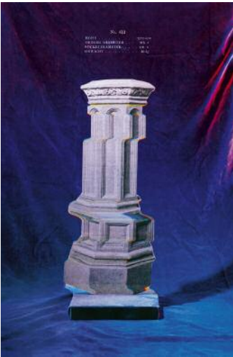
01 Thomas Albdorf: Musterbuch Nr. 412 , 2018