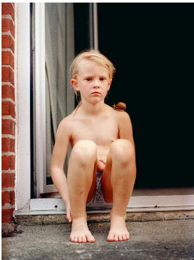
Regine Petersen, Girl with Snail, from the series "To Think About Things," 2006, 66 x 53 cm © Regine Petersen/VG-Bild-Kunst Bonn; with courtesy of Art Collection Deutsche Börse