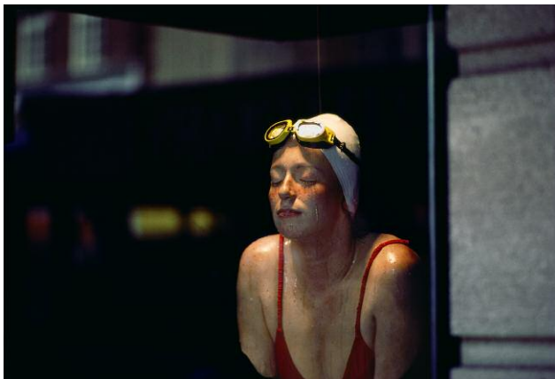
Ernst Haas, New York, 1981, 45 x 65 cm © Ernst Haas/The Estate of Ernst Haas; with courtesy of Art Collection Deutsche Börse