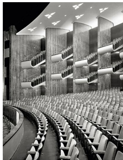
Karl Hugo Schmölz, Opera house, Cologne, 1957, 80 x 64 cm