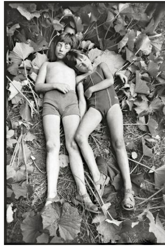
Gerd Danigel, By the roadside of Schönhauser Allee, 1980, 40 x 28 cm © Gerd Danigel; with courtesy of Art Collection Deutsche Börse