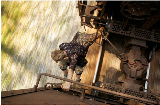
Mike Brodie, #3102, from the series "A Period of Juvenile Prosperity", 2006–2009, 41 x 59 cm ©Mike Brodie; with courtesy of Art Collection Deutsche Börse