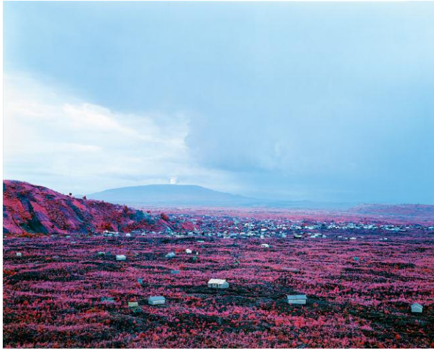
Richard Mosse, City of No Sun, 2012, 183 x 229 cm