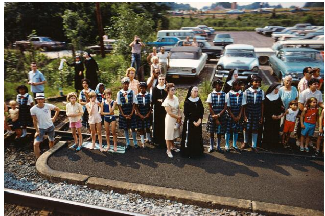
Paul Fusco, from the series "RFK Funeral Train," 1968, 46 x 69 cm