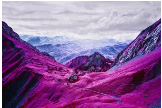
10_ View from Pilatus, Luzern. 2017