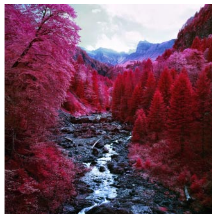
06_ Sihl, Schwyz. 2017