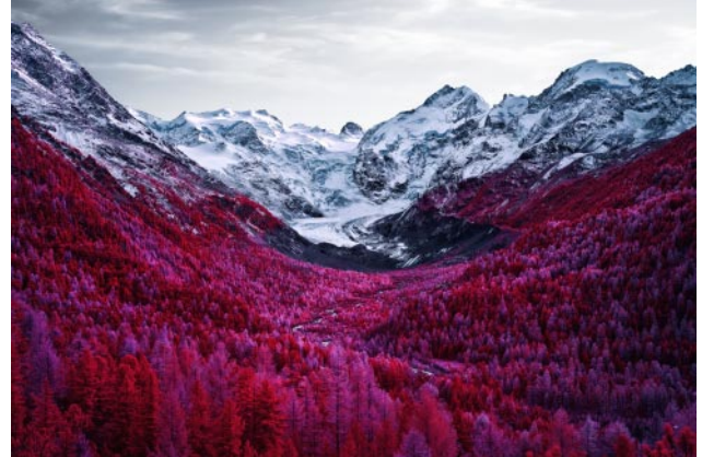
02_ Morteratsch, Grisons. 2019