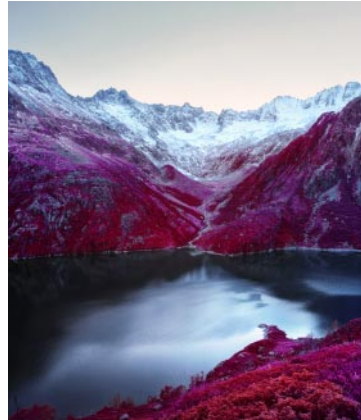
08_ Dammagletscher, Uri. 2020