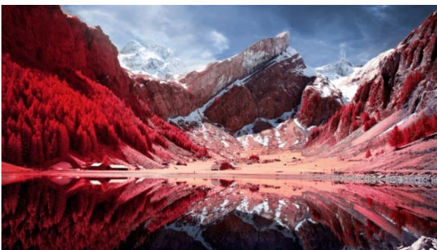
05_ Seealpsee, Appenzell. 2016