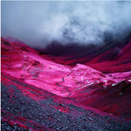
07_ Plessur. 2016