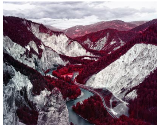
04_ Rheinschlucht. 2019