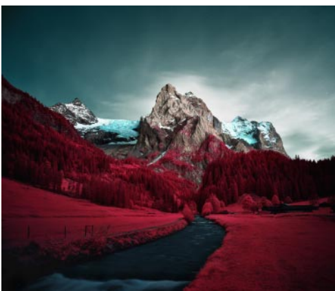
11_ Wetterhorn. 2019