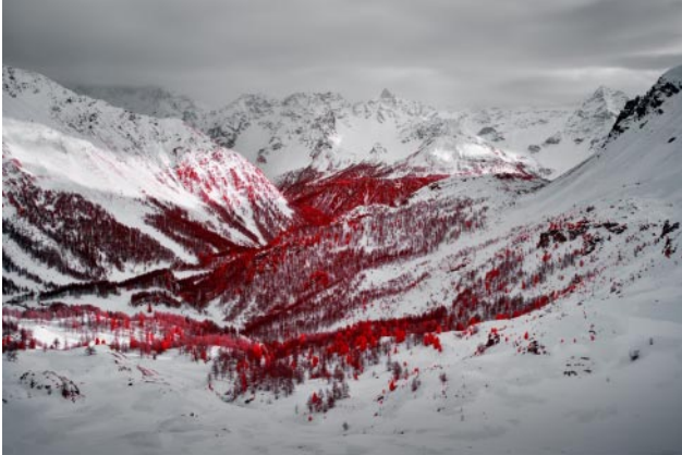
01_ Piz dal Teo, Grisons. 2018