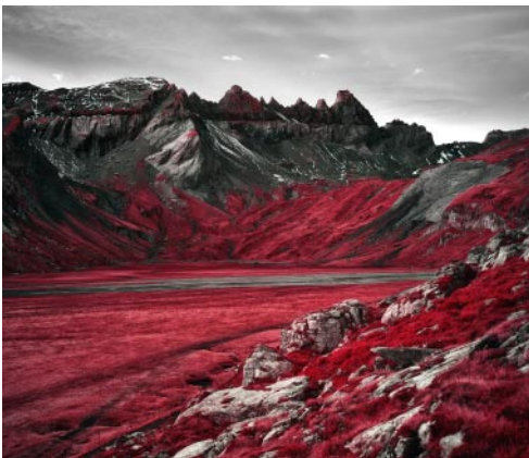
09_ Sardona, Grisons. 2021