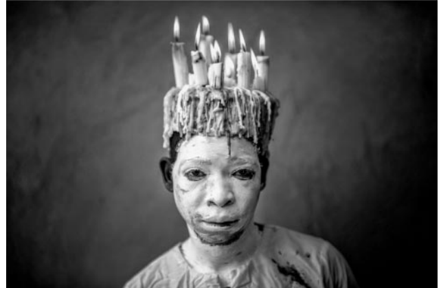
08_A Candle Man, Inhambane, Mozambique, 2021 © Mário Macilau