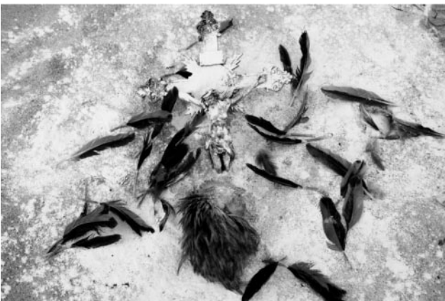
11_Animism and Christianity in the same Ritual, Mozambique, 2015