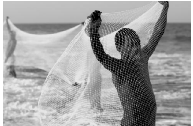
04_ Fishing Net, Maputo, Mozambique, 2019 © Mário Macilau