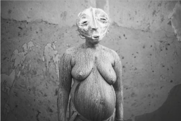
07_God Bless my son, Maputo, Mozambique, 2015 © Mário Macilau