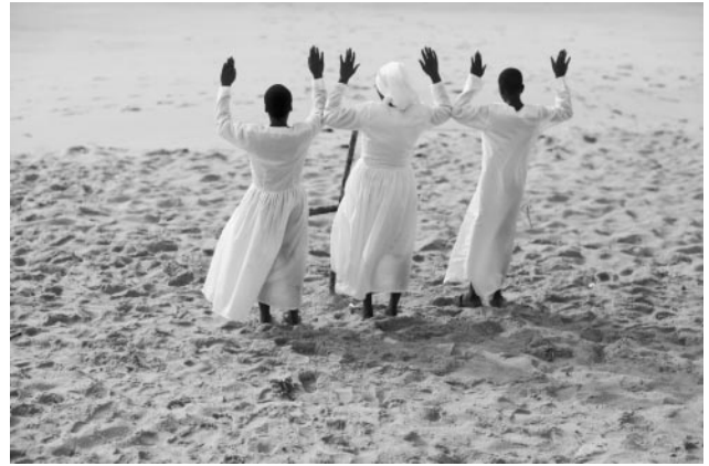
02_ Prayers, Maputo, Mozambique, 2020