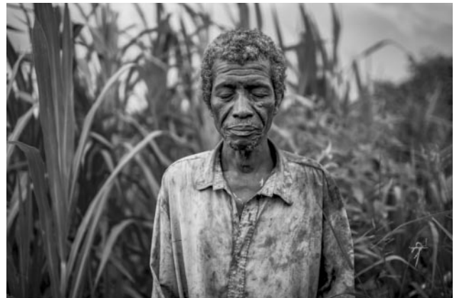
10_A group of people lying Mozambique, 2022 © Mário Macilau