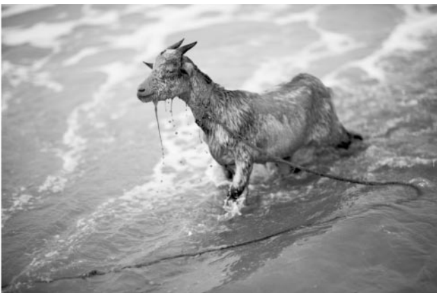
05_ A Goat, Nova Mambone, Inhambane, Mozambique, 2020