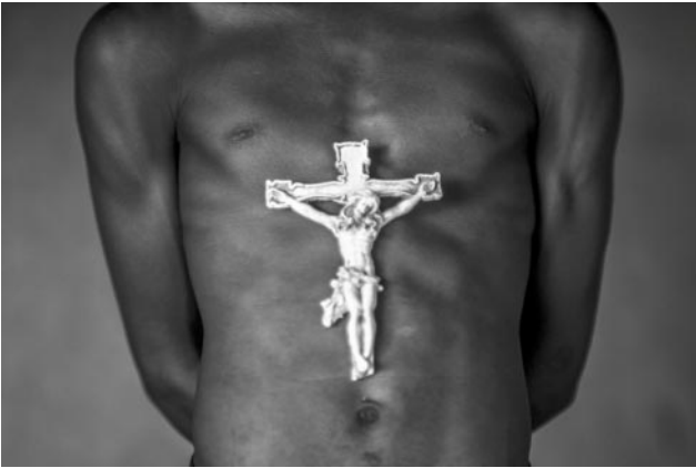
01_ A Crucifix Chest, Nova Mambone, Inhambane, Mozambique, 2020 © Mário Macilau