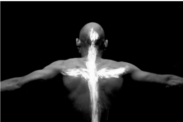
09_Man with a Cross, Maputo, Mozambique, 2017