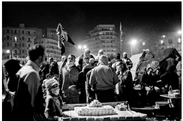
10. © Emine Gozde Sevim