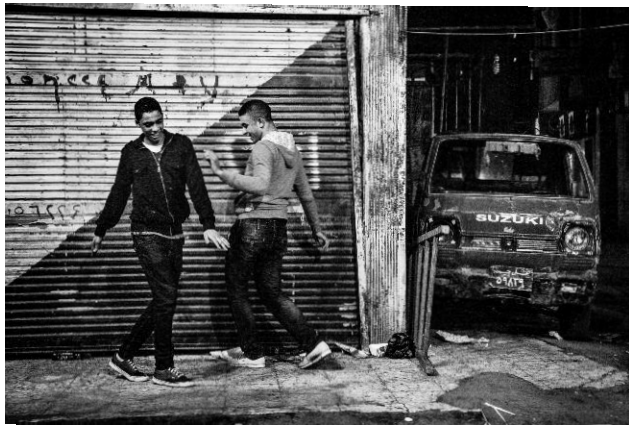
3. © Emine Gozde Sevim