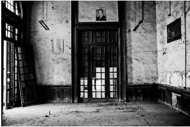
7. © Emine Gozde Sevim