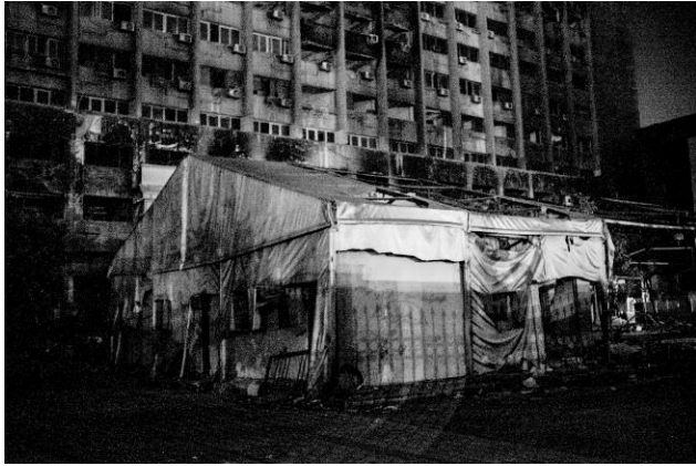
1. © Emine Gozde Sevim