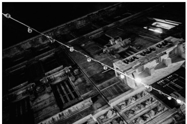
4. © Emine Gozde Sevim