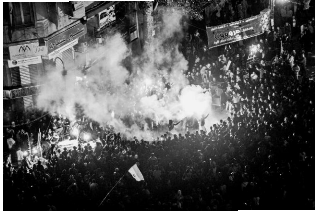
2. © Emine Gozde Sevim