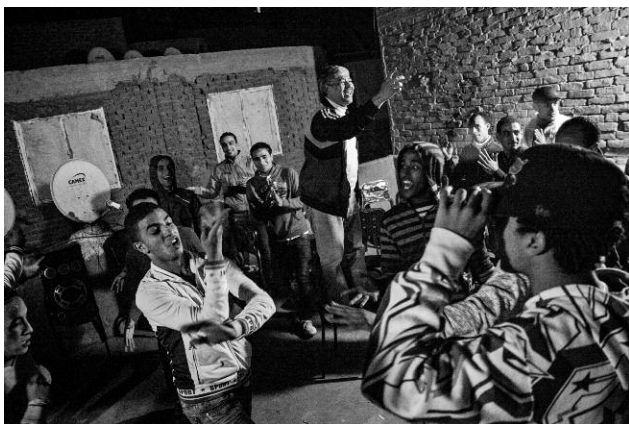
5. © Emine Gozde Sevim