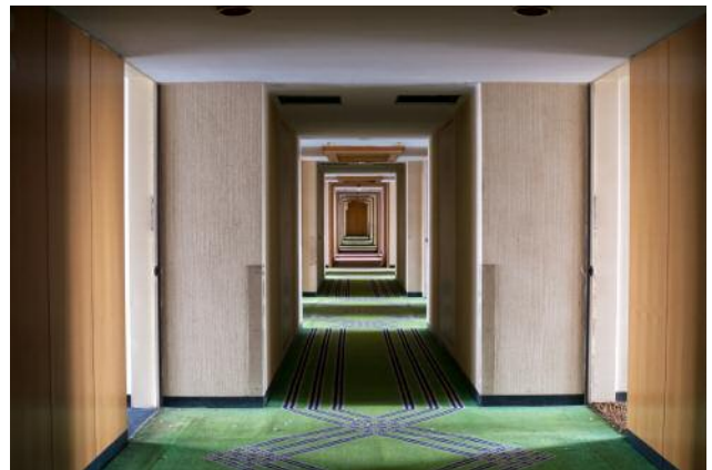
10_ © Yvonne Mueller & Leif Bennett