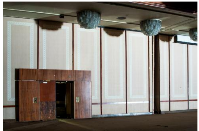
6_ © Yvonne Mueller & Leif Bennett