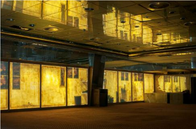
1_ © Yvonne Mueller & Leif Bennett