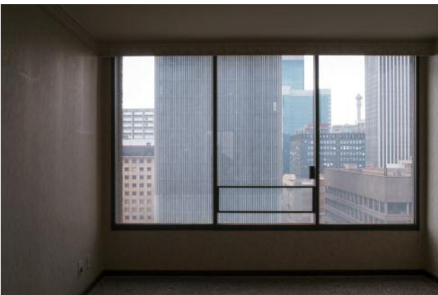
11_ © Yvonne Mueller & Leif Bennett