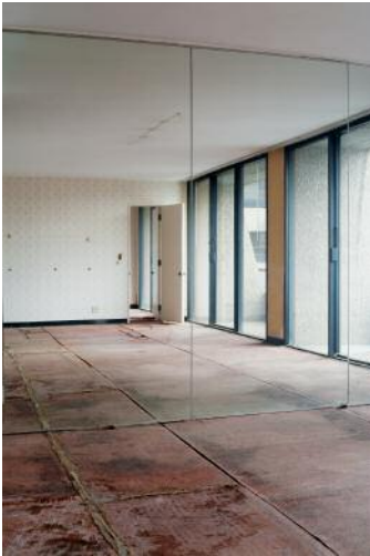
7_ © Yvonne Mueller & Leif Bennett