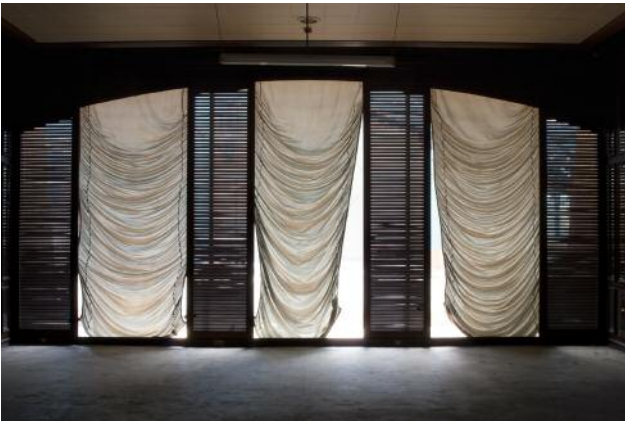
3_ © Yvonne Mueller & Leif Bennett