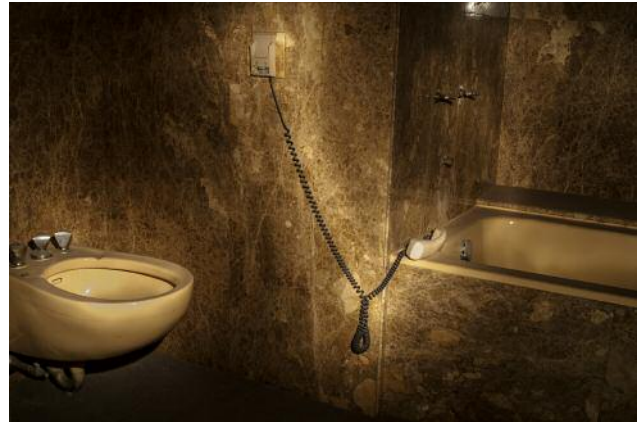
8_ © Yvonne Mueller & Leif Bennett