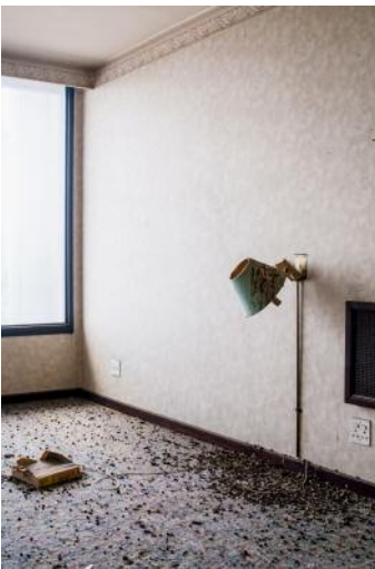
9_