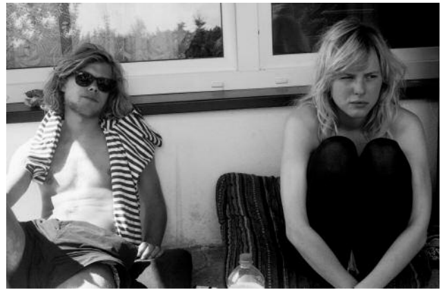
8 © Gioia de Bruijn, courtesy of Flatland Gallery, Amsterdam