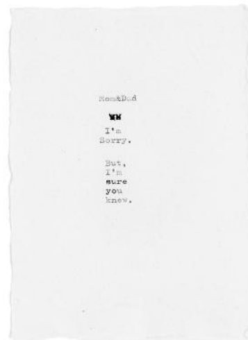
6 © Gioia de Bruijn, courtesy of Flatland Gallery, Amsterdam