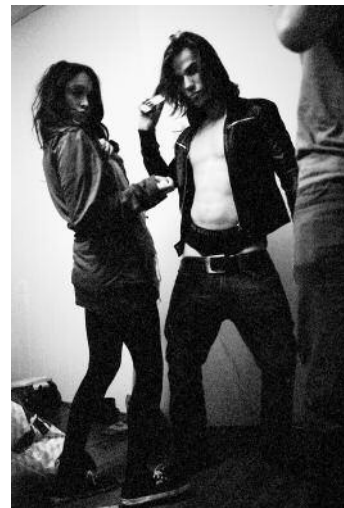
12 © Gioia de Bruijn, courtesy of Flatland Gallery, Amsterdam