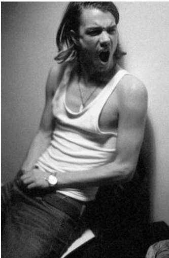
3 © Gioia de Bruijn, courtesy of Flatland Gallery, Amsterdam