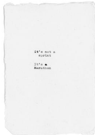
4 © Gioia de Bruijn, courtesy of Flatland Gallery, Amsterdam