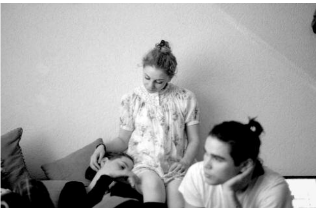
11 © Gioia de Bruijn, courtesy of Flatland Gallery, Amsterdam