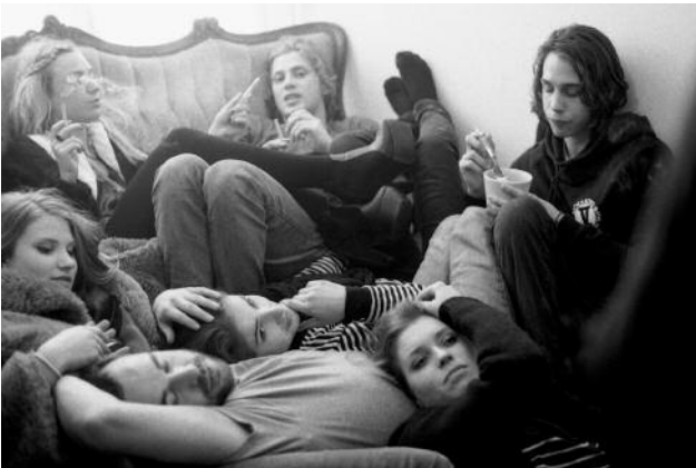
9 © Gioia de Bruijn, courtesy of Flatland Gallery, Amsterdam