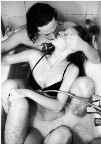
1 © Gioia de Bruijn, courtesy of Flatland Gallery, Amsterdam