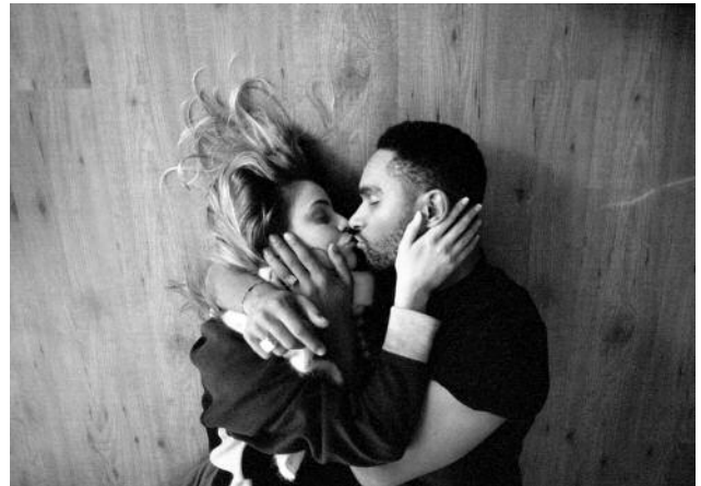
10 © Gioia de Bruijn, courtesy of Flatland Gallery, Amsterdam