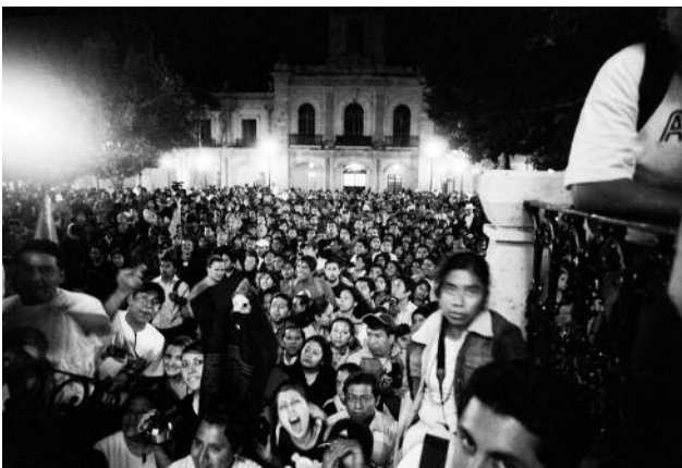
5 Oaxaca de Juárez, Oaxaca © Samantha Dietmar