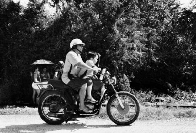
7 Along the way © Samantha Dietmar