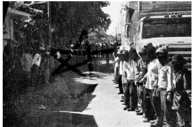
10 Huixtla, Chiapas