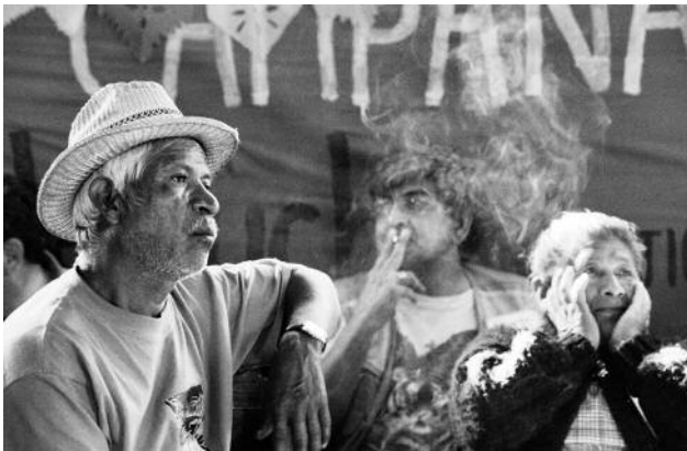
3 La Veracruz, Querétaro