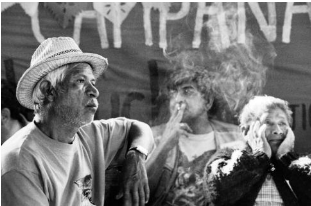
3 La Veracruz, Querétaro