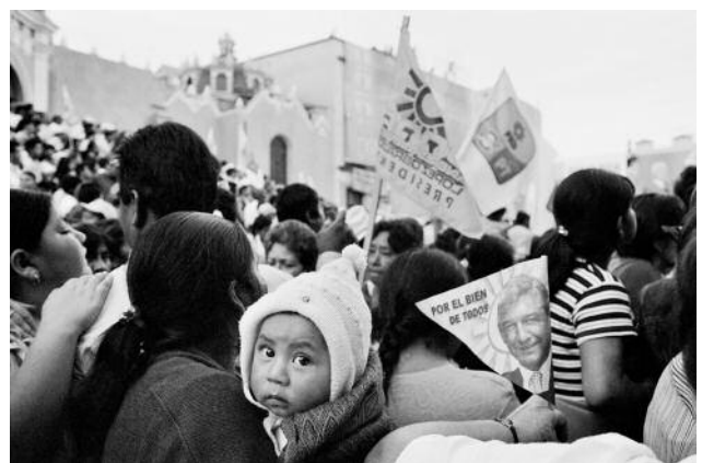
12 Xalapa, Veracruz