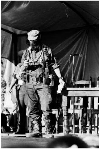
1 Nuevo Villaflores, Chiapas