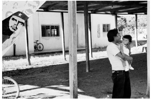
8 Nuevo Villaflores, Chiapas © Samantha Dietmar