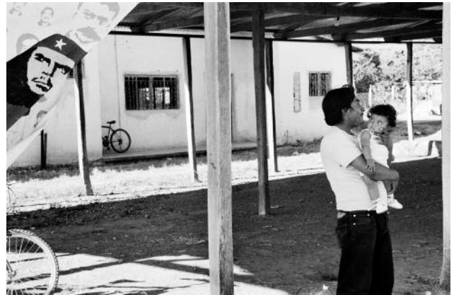
8 Nuevo Villaflores, Chiapas