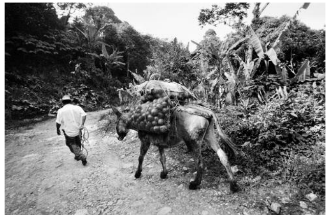
6 Near Córdoba, Veracruz