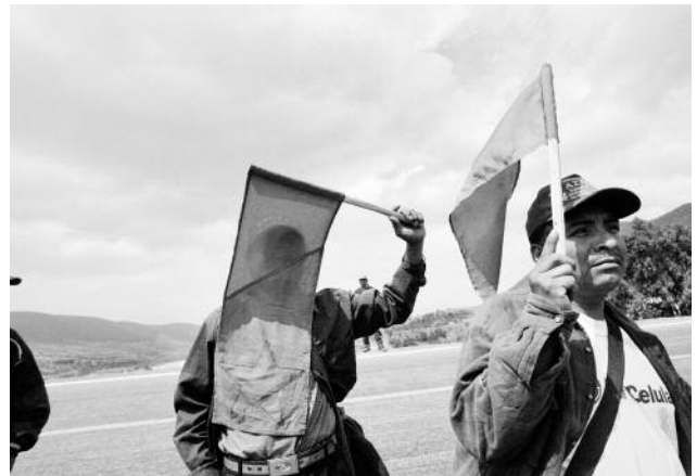
4 Tlaxiaco, Oaxaca © Samantha Dietmar