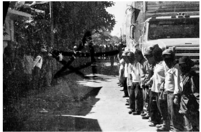
10 Huixtla, Chiapas