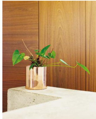
4 Sören wants more than just a job.