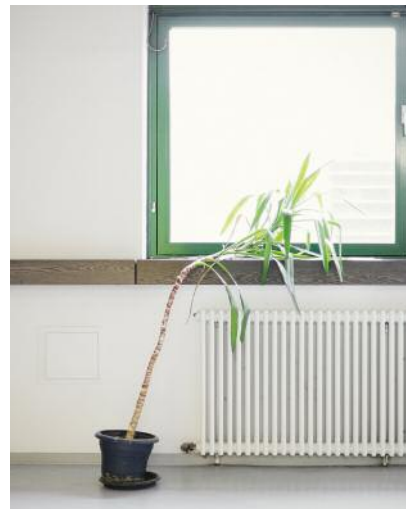
6 Ute suffers from daydreaming.