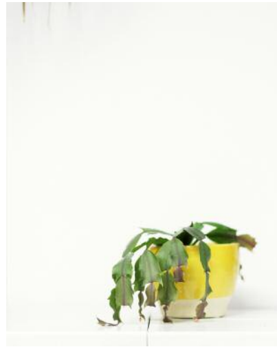
8 Paul is sad. © Frederik Busch