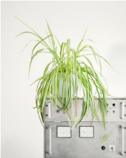
1 Sabine adores going dancing.