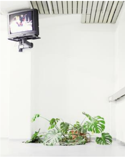
7 Dagmar doesn't like television.