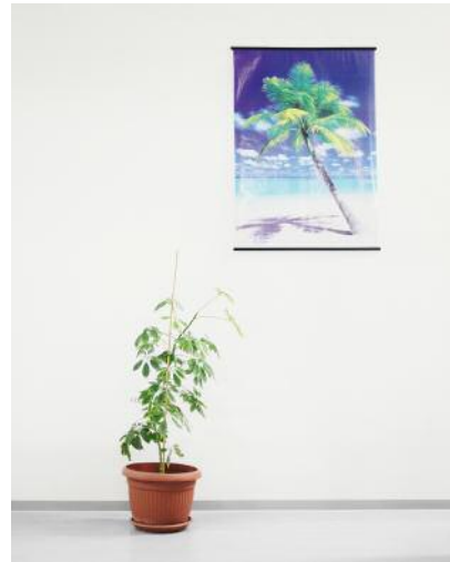
2 Albert has been weight lifting for a year.