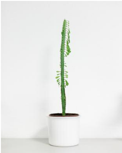
3 René is keeping a secret.