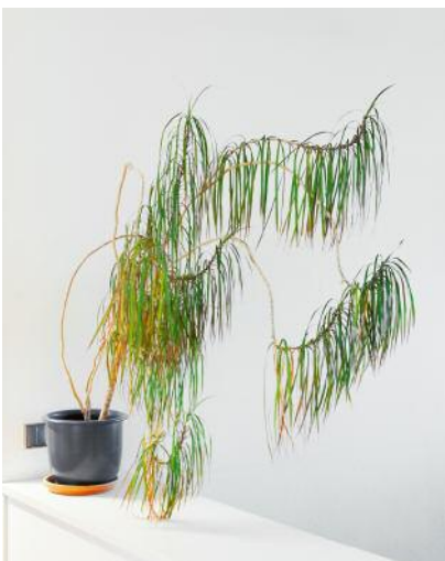
5 Solveigh likes foreign cultures.