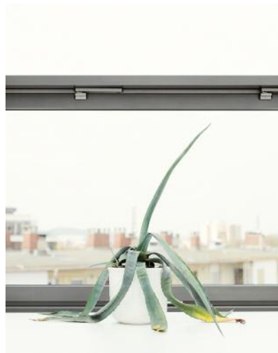
10 Ingrid isn't giving up. © Frederik Busch