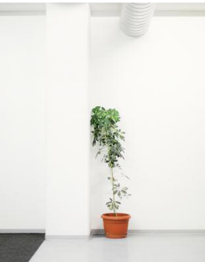
9 Siegfried is embarrassed.