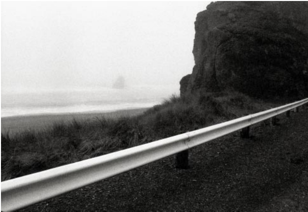
07_United States, 1970s