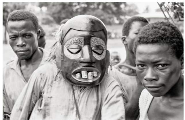
12_Nigeria, 1970s