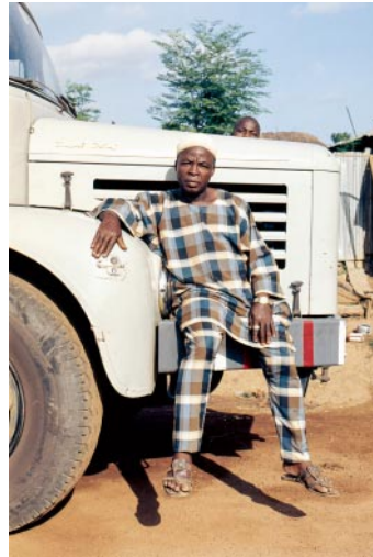
02_ Nigeria, 1970s