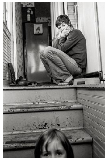
04_ United States, 1970s