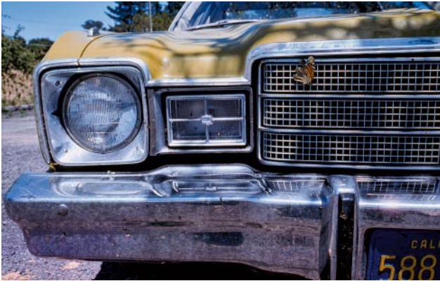
01_ United States, 1970s