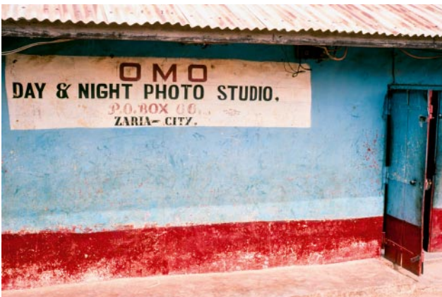
03_ Nigeria, 1970s