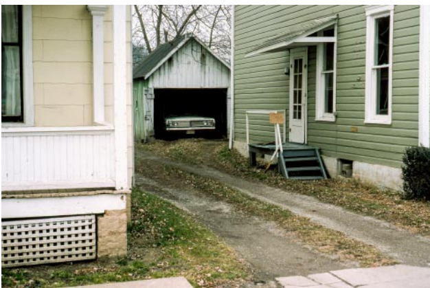
05_ United States, 1970s