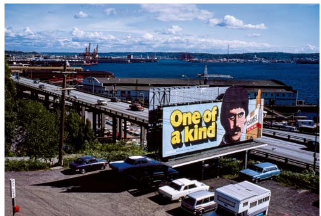
06_ United States, 1970s