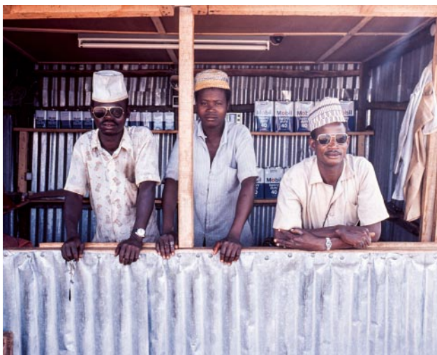
11_Nigeria, 1970s