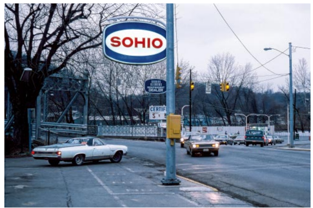
08_United States, 1970s