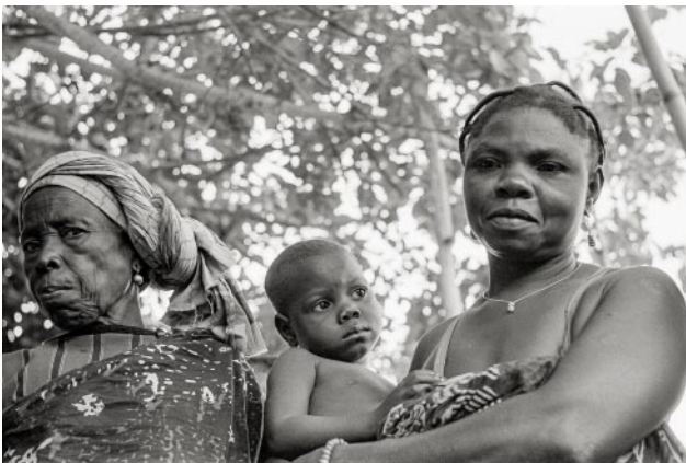
09_Nigeria, 1970s