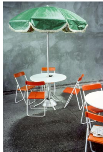
10_United States, 1970s