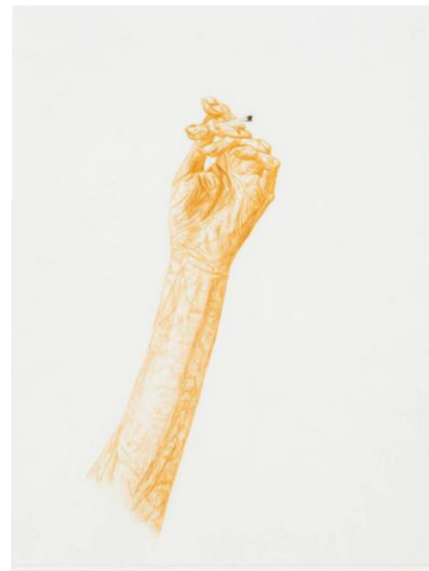
06 Michael Landy, Self Contained (Arm), 2003 © Michael Landy.