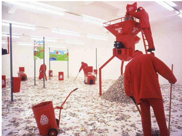
09 Michael Landy, Scrapheap Services, 1995