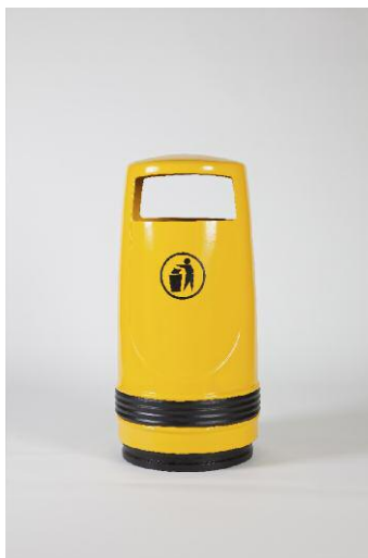
11 Michael Landy, Self Portrait As Rubbish Bin, 2012