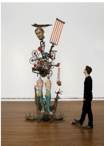
05 Michael Landy, Multi-Saint, 2013