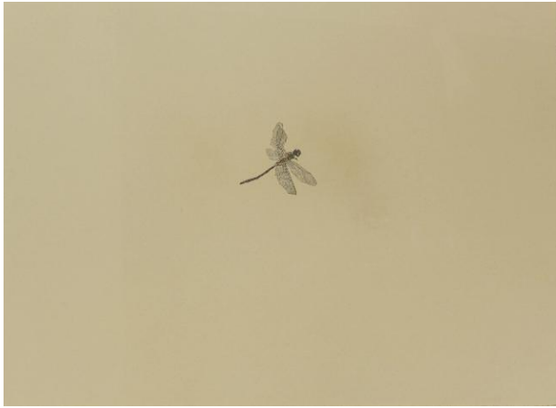
01 Michael Landy, Dragonfly, 2004