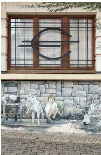
5_Mondorf-les-Bains, LUX, 2015 © Ruth Stoltenberg