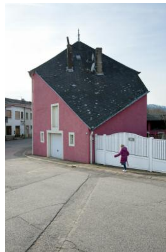
6_Montenach, FRA, 2015