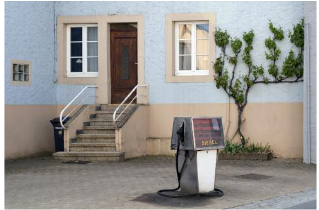
8_Schengen-Remerschen, LUX, 2015