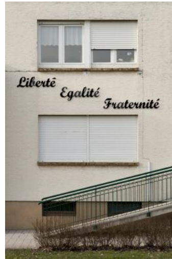
2_Ritzing, FRA, 2015