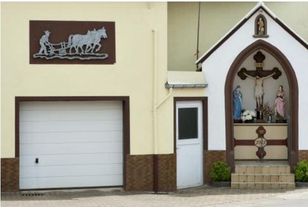
9_Perl-Borg, DEU, 2015