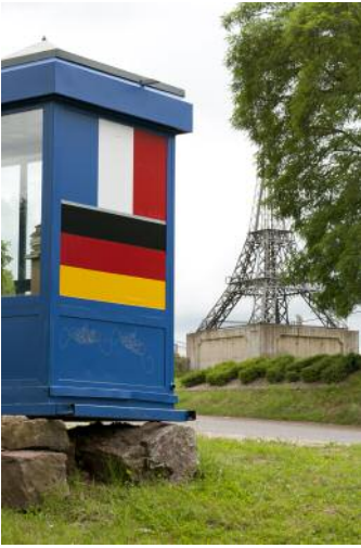
7_Apach, FRA, 2015 © Ruth Stoltenberg