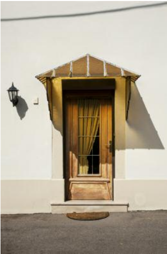
1_Apach, FRA, 2014