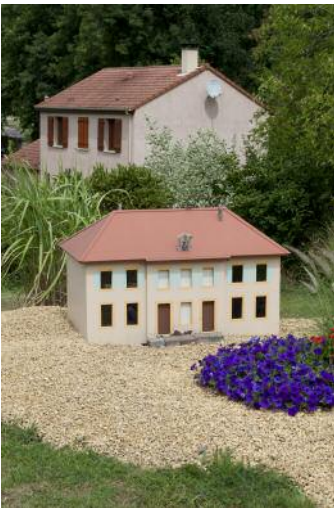
3_Manderen, FRA, 2015