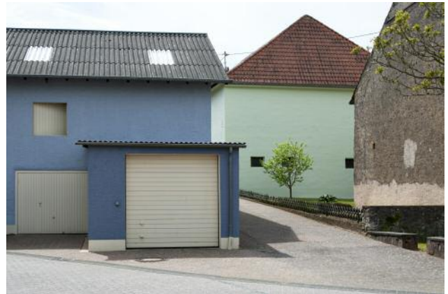
10_Perl-Borg, DEU, 2015 © Ruth Stoltenberg