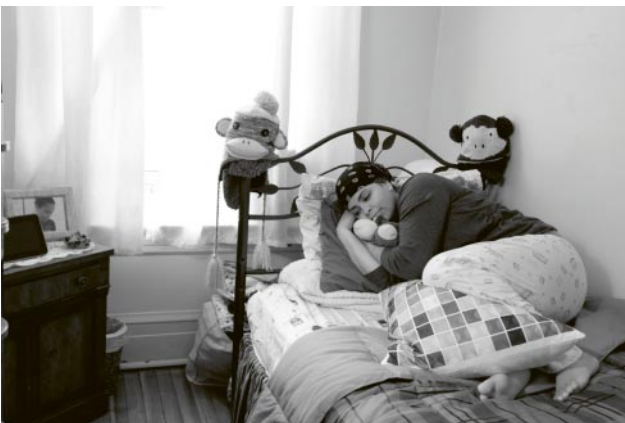
05_Evelyn (Astoria, NY 2015)