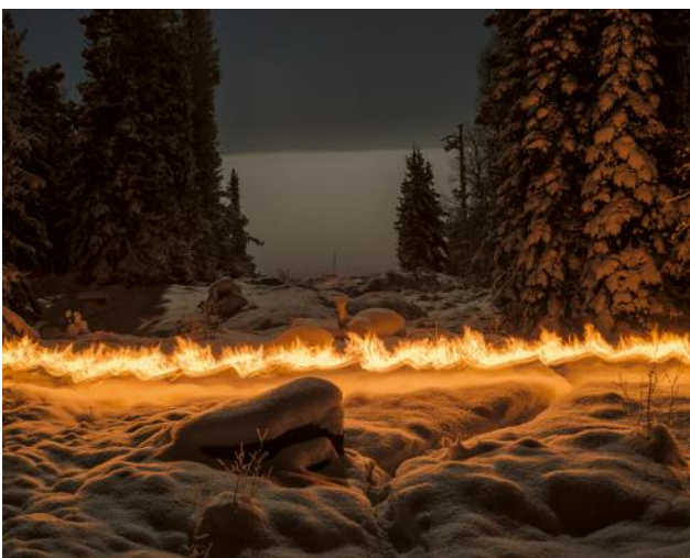
05 Border between Sweden (left) and Norway (right) at Moldusen. An approximately twenty-metre wide clearing in the forest separates the two Scandinavian nations, consequently cutting Finniskogen in two. Grue Finnskog 2016.