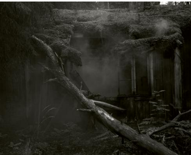
09 Abandoned house in Tiveden National Park, one of the southernmost areas populated by Forest Finns. Sweden 2016.