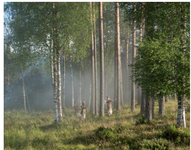
12 A declaration of independence for the The Republic of Finnskogen has taken place every second weekend in July since 1970. It is a three-day celebration of the region's Finnish heritage, complete with an outdoor theatre play. Svullrya 2016.