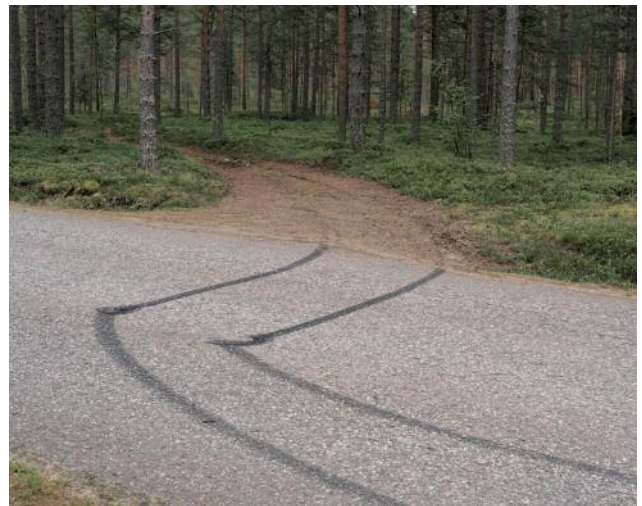
10 Skidmarks in the Savonia region, the epicentre of the Forest Finn migration in the 17th century. Finland 2015.