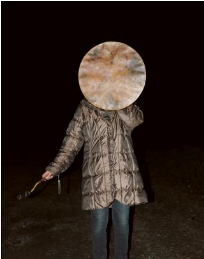
01 Woman with shaman drum. Svullrya 2015.