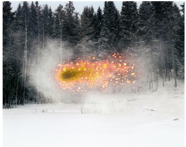
02 Lindalstorpet farm by Lake Skasen, one of the first farms to be settled in Finniskogen. Grue Finnskog 2016.