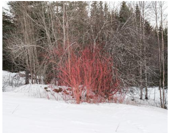
04 Red bush at Lindalstorpet farm. Grue Finnskog 2016.