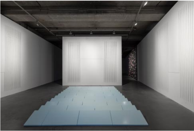
07_Özlem Günyol & Mustafa Kunt, Neither Up nor Down, 2019–2023, Self-Portrait (Çamlıca), 2024 / Installation view, Dirimart, Istanbul, Photo: Nazlı Erdemirel © 2025 OZLEM GÜNYOL & MUSTAFA KUNT