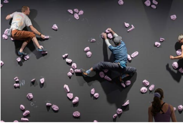
01_ Özlem Günyol & Mustafa Kunt, Free Solo, 2019–2025 / Installation view, Dirimart, Istanbul, Photo: Nazlı Erdemirel © 2025 ÖZLEM GÜNYOL & MUSTAFA KUNT