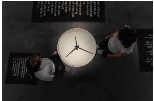
10_Özlem Günyol & Mustafa Kunt, The Clock, 2022, Installation view, Dirimart, Istanbul, Photo: Nazlı Erdemirel © 2025 OZLEM GÜNYOL & MUSTAFA KUNT