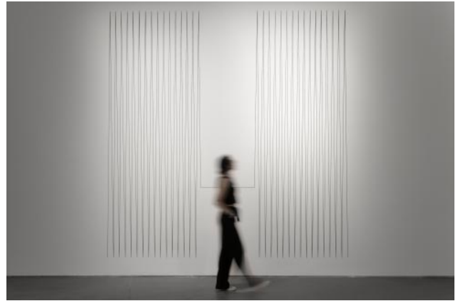
08_Özlem Günyol & Mustafa Kunt Self-Portrait (Çamlıca), 2024 / Installation view, Dirimart, Istanbul, Photo: Nazlı Erdemirel © 2025 OZLEM GÜNYOL & MUSTAFA KUNT