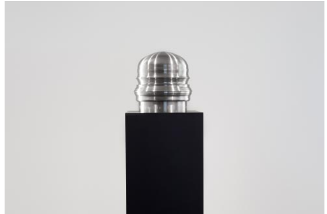
04_ Özlem Günyol & Mustafa Kunt, Mr. Bertelli, you are right. The profile still continues., 2019 / Installation view, Dirimart, Istanbul, Photo: Nazlı Erdemirel © 2025 ÖZLEM GÜNYOL & MUSTAFA KUNT