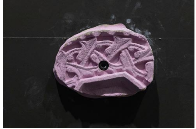
02_ Özlem Günyol & Mustafa Kunt, Free Solo (Detail), 2019–2025 / Installation view, Dirimart, Istanbul, Photo: Nazlı Erdemirel © 2025 ÖZLEM GÜNYOL & MUSTAFA KUNT