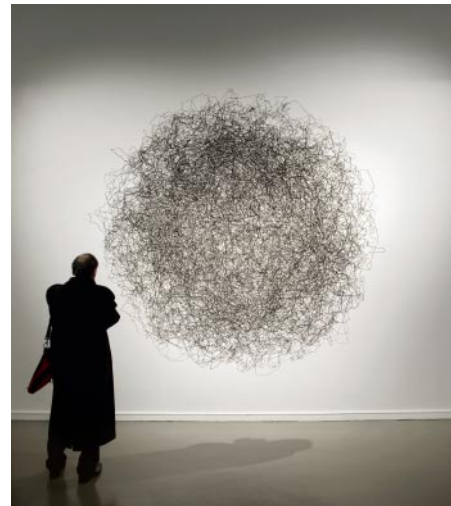
06_ Özlem Günyol & Mustafa Kunt, Ceaseless Doodle, 2009, Photo: Cem Yücetaş © 2025 ÖZLEM GÜNYOL & MUSTAFA KUNT