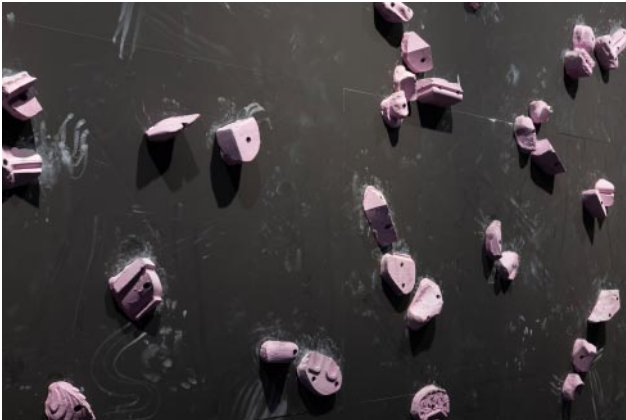
03_ Özlem Günyol & Mustafa Kunt, Free Solo (Detail), 2019–2025, Installation view, Dirimart, Istanbul