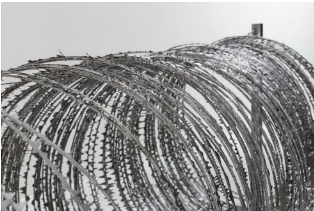
05_ Özlem Günyol & Mustafa Kunt, Self Defence, 2015, Photo: Işık Kaya © 2025 ÖZLEM GÜNYOL & MUSTAFA KUNT