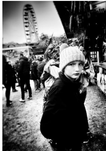
10_© Benita Suchodrev