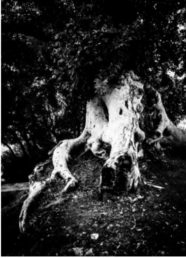
07_© Benita Suchodrev