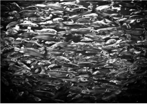
13_© Benita Suchodrev