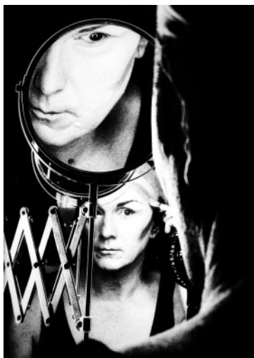
05_© Benita Suchodrev