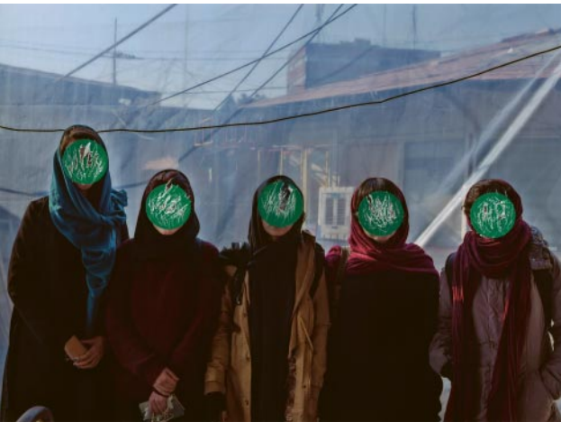
09_Tehran, 2017