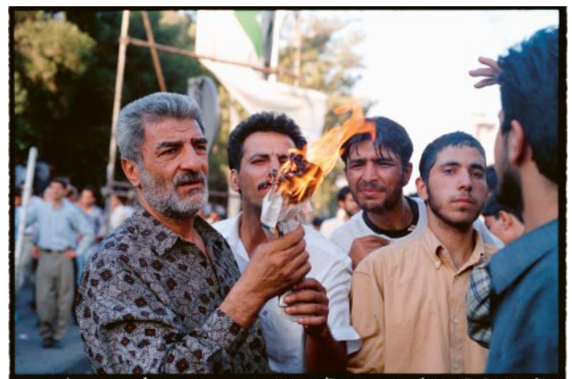
06_Students asking for reforms during a protest in Tehran. (Tehran, 1999)