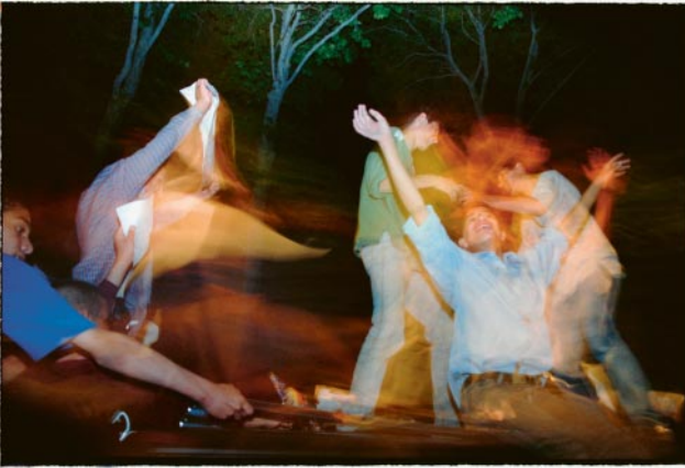
07_The election campaign. (Tehran, 2000)