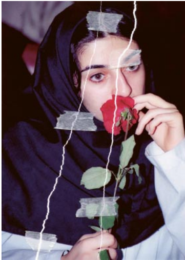
01_Girl smelling a rose, during an election rally for politicians promising more freedom for young people. Torn print, taped back together. (Tehran, 2020)