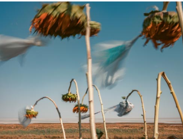
11_Uremia, 2017