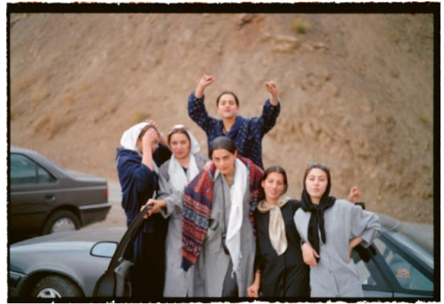
02_Dancing with friends and their parents in the mountains outside Tehran. (Shemshak, 1998)