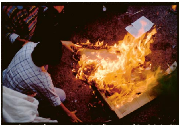
05_After riot police used tear gas, protesters burnt cardboard to use the smoke to drive the tear gas away. (Tehran, 1999)