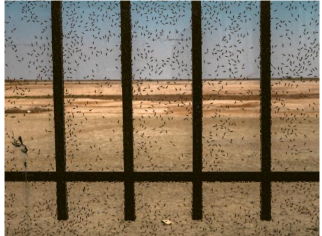
08_Uremia, 2017