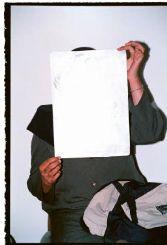
04_A girl hiding her face, in a special shelter for vulnerable women. (Tehran, 1998)