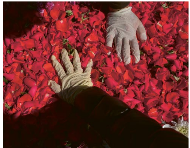
12_Behesht Zahra cemetery, 2019