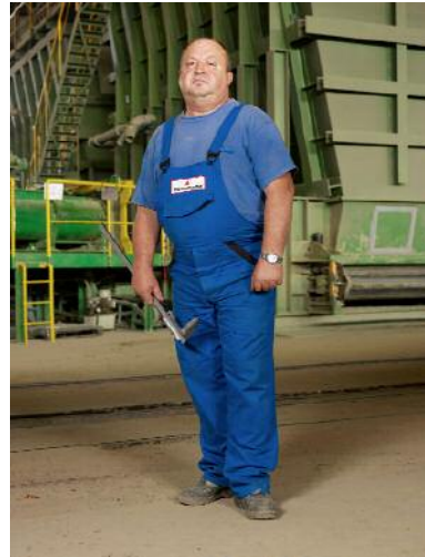
8 NOVOSÉDLÝ 07, CZECH REPUBLIC, 2013