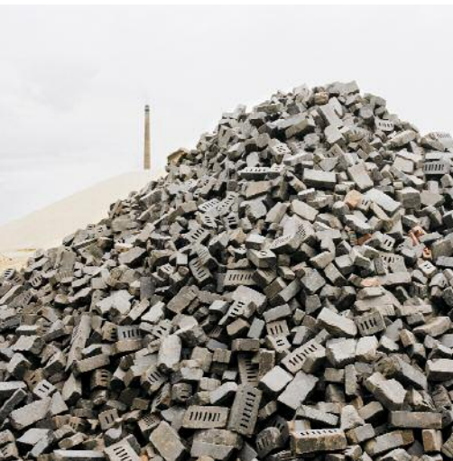
9 WIENERBERGER 7, 2014