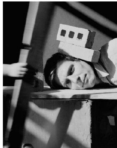
10 BUILD YOUR HOUSE ON THE ROCK, from THE HERO MOTHER - HOW TO BUILD A HOUSE, 2016 © Peter Puklus