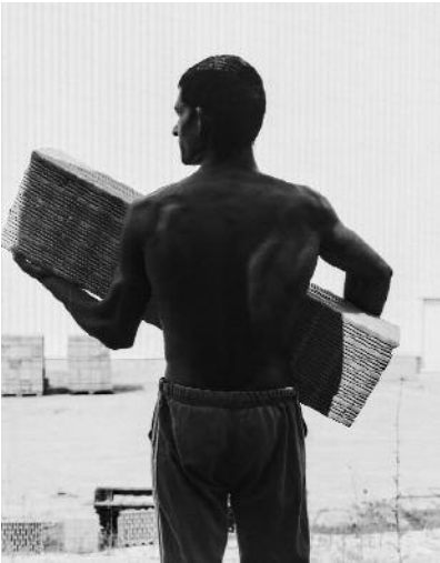
1 HUMAN SCALE III, LUKOVIT, BULGARIA, 2014