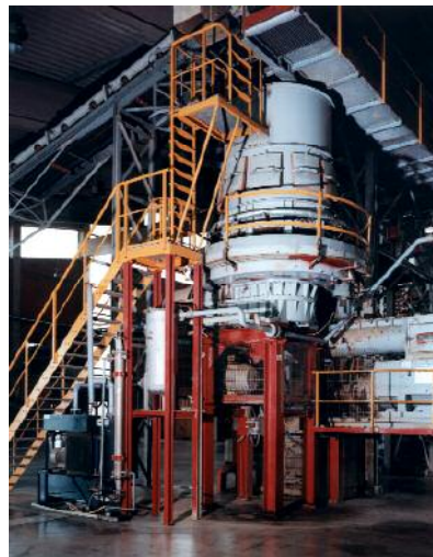
12 WERK BÉKÉSCSABA II, 2015 © Markus Krottendorfer