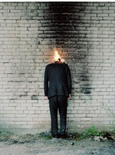
11 1001 DEGREES, 2015