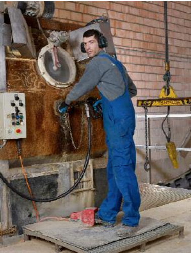
7 NARVIK TEGELEN 25, NETHERLANDS, 2014