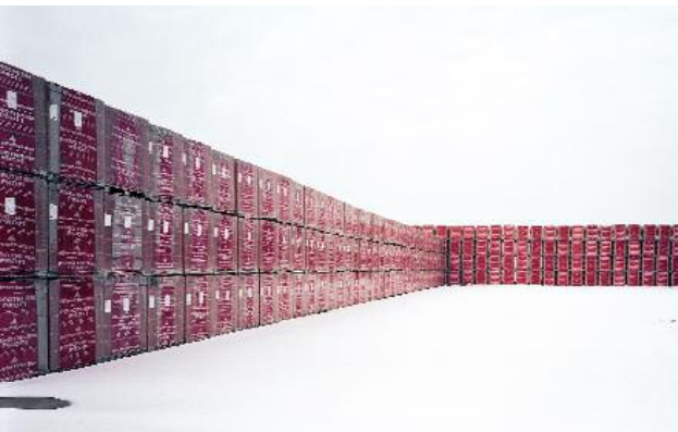
3 MAGYAR TÉGLA 06, TISZAVASVARI, UNGARN, 2012