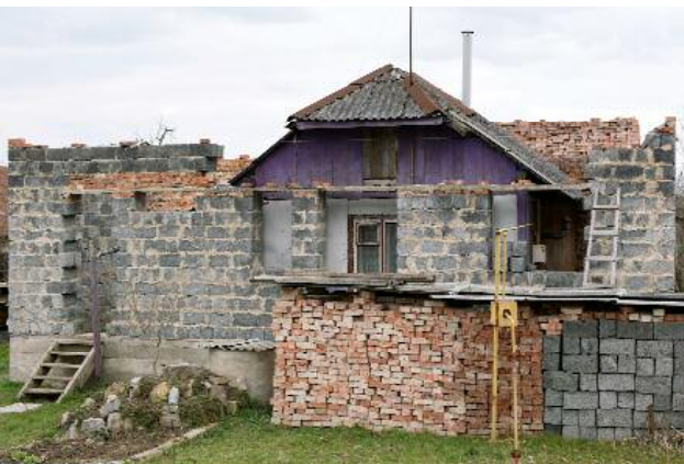
5 UKRAINE, 2015 © Martin Kollar