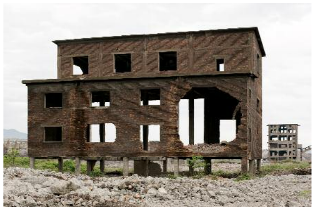
6 ALBANIA, 2015 © Martin Kollar