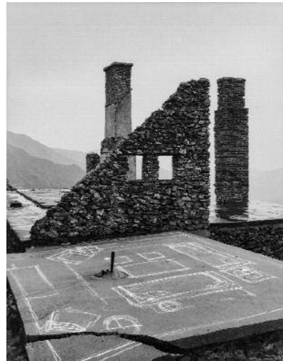
2 HUMAN SCALE IX, TRANSFOGARAS HIGHWAY, ROMANIA, 2014