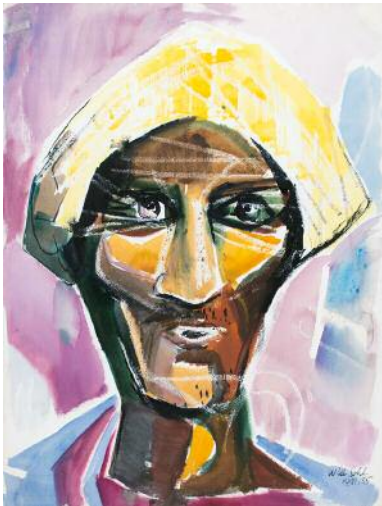
3_Kopf eines Arabers, 19.12.1955. Aquarell auf Papier, 64 x 49 cm