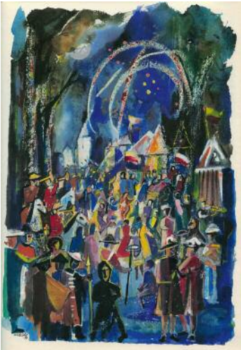
7_Gartenkonzert im Schloss Gaibach, Illustration aus: Fürstbischöfliche Badereise 1722, S. 67 © Künstlernachlässe Mannheim