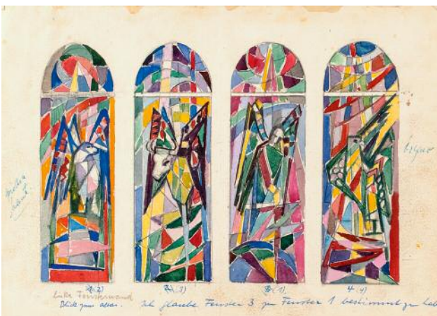
11_Entwurf für die Fenster in der Deutschsprachigen Evangelischen Gemeinde in Barcelona: o.J. Aquarell auf Papier, 29,5 x 32,5 cm