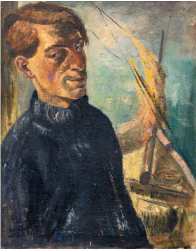
1_Selbstbildnis mit Segelboot, 1932. Öl auf Leinwand, 70 x 55 cm © Künstlernachlässe Mannheim