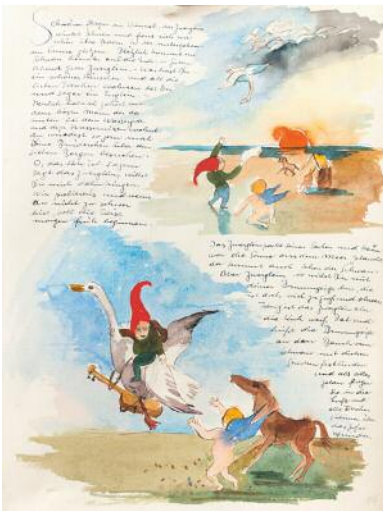
9_Die Geschichte vom bösen Mann: o.T., 1937. Aquarell auf Papier, 31,5 x 25,5 cm © Künstlernachlässe Mannheim