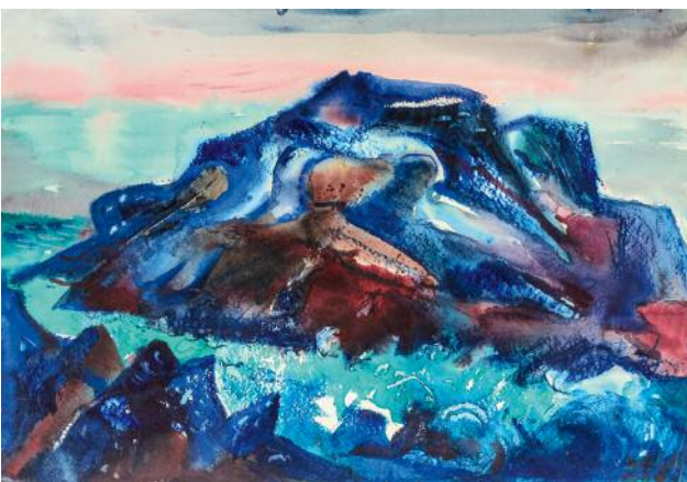
5_Großer blauer Fels, Island, 1966. Mischtechnik auf Papier, 50 x 72,5 cm © Künstlernachlässe Mannheim