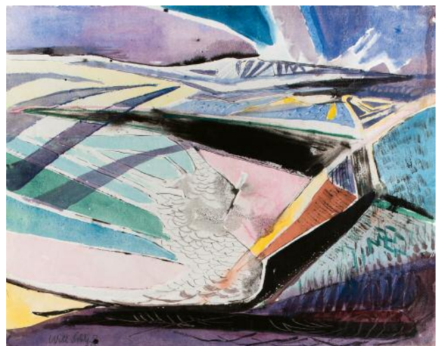
6_Wolkenschatten, 1952. Aquarell auf Papier, 50 x 65 cm © Künstlernachlässe Mannheim