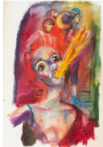
8_Jahrmarktserinnerungen, 1941: Feuerspuckende Artistin. Aquarell auf Papier, 45,3 x 31,8 cm © Künstlernachlässe Mannheim