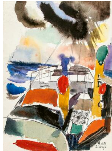
4_Biskaya, 4.11.1955. Aquarell auf Papier, 39 x 29 cm