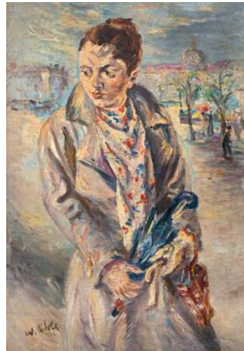
2_Mädchen mit buntem Schal, 1932. Öl auf Leinwand, 91,5 x 63 cm © Künstlernachlässe Mannheim