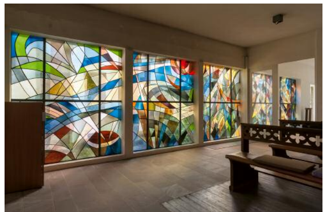
12_Glasfenster Brüderkapelle, Stift Neuburg, Ziegelhausen © Künstlernachlässe Mannheim