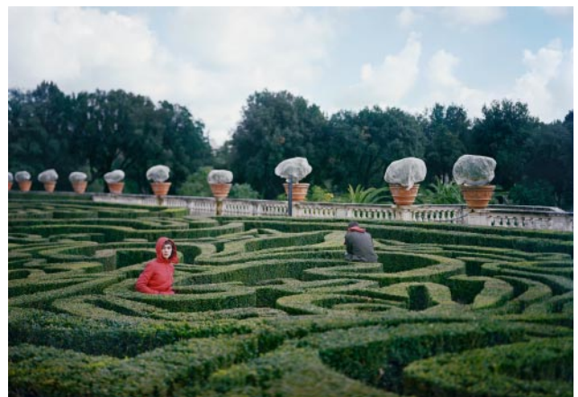
12_Noemí, Joseant, 2010