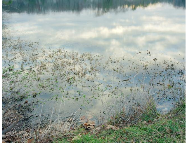
8 Greenbelt Lake, GREENBELT, MARYLAND