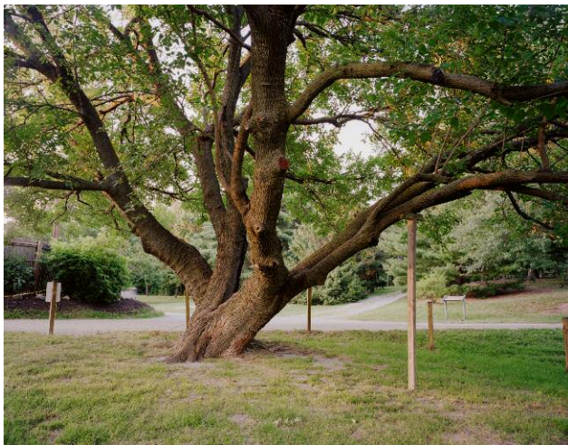
5 Tree Crutch, GREENBELT, MARYLAND