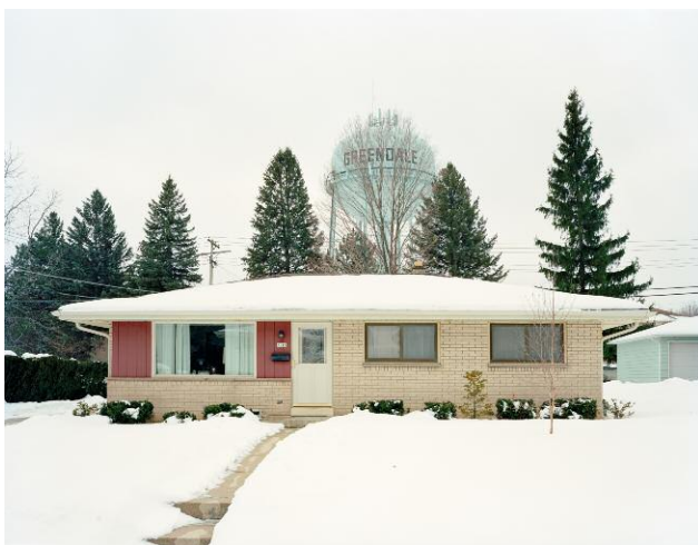
11 Water Tower, GREENDALE, WISCONSIN