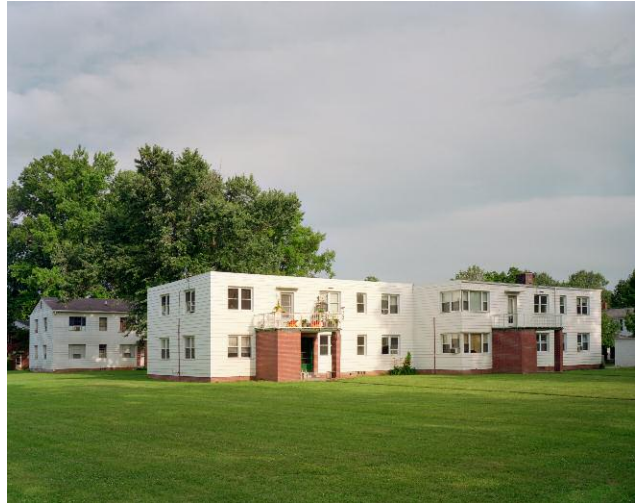
2 Farragut House, GREENHILLS, OHIO