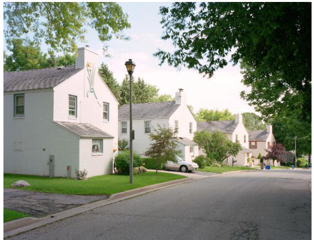
4 Daffodil House, GREENDALE, WISCONSIN © Jason Reblando