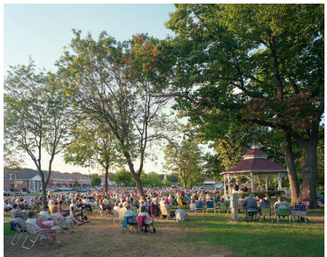
12 Gazebo, GREENDALE, WISCONSIN