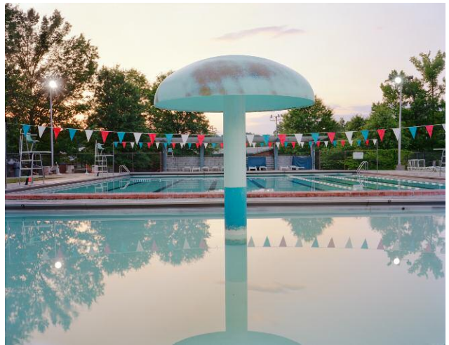
6 Mushroom, GREENBELT, MARYLAND © Jason Reblando