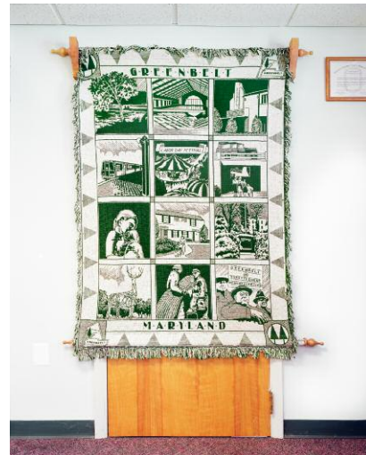
10 Quilt, GREENBELT, MARYLAND © Jason Reblando