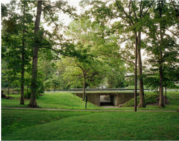
1 Underpass, GREENBELT, MARYLAND